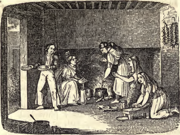
A KITCHEN SCENE.

comal ( comalli , by the Indians), and placed over the fire, where, in less than three minutes, it is baked and ready for use. The thinness of the tortilla is always a great test of skill in the maker, and much rivalry ensues in the art of preparation. The office of making tortillas has, from the earliest times, pertained chiefly to the women, who appear to be better adapted to this employ than the other sex, both as regards skill and dexterity, in preparing this particular food for the table. I perfectly agree with the historian Clavigero, however, in the opinion that "although this species of corn-bread may be very wholesome and substantial, and well-flavored when newly made, it is unpleasant when cold."