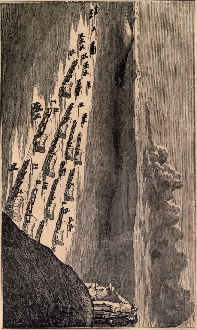
MARCH OF THE CARAVAN.