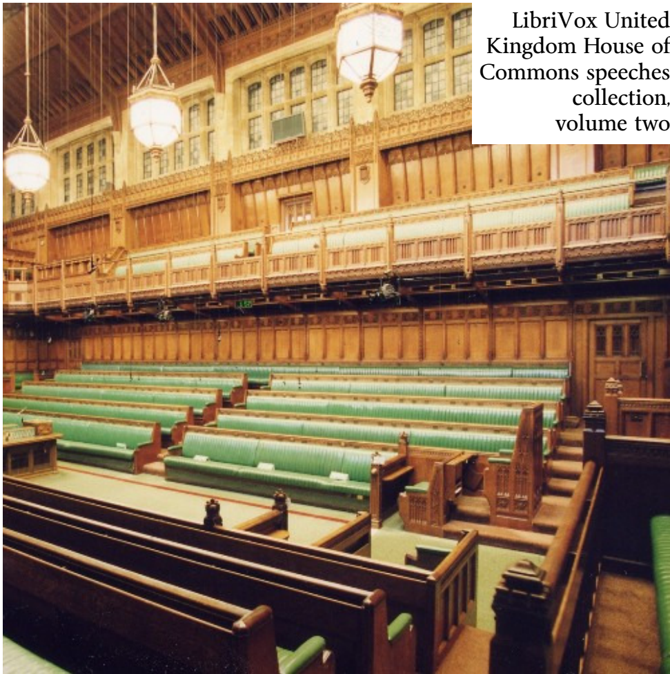
LibriVox United Kingdom House of Commons speeches collection, volume two

United Kingdom House of Commons speeches collection, vol 2