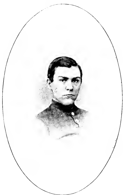
THE AUTHOR AT CLOSE OF WAR