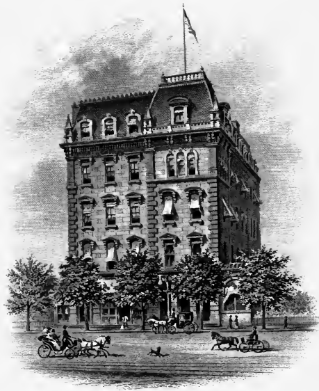
THE DEPARTMENT OF JUSTICE