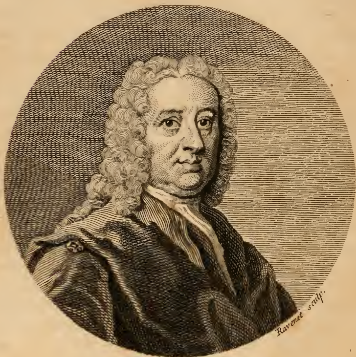
ST. JOHN Lord BOLINBROKE.