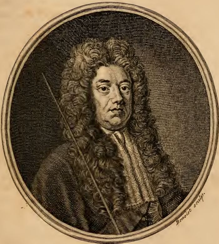
SIDNEY Earl of GODOLPHIN .