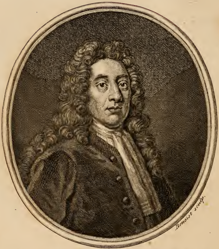
BYNG Lord TORRINGTON .