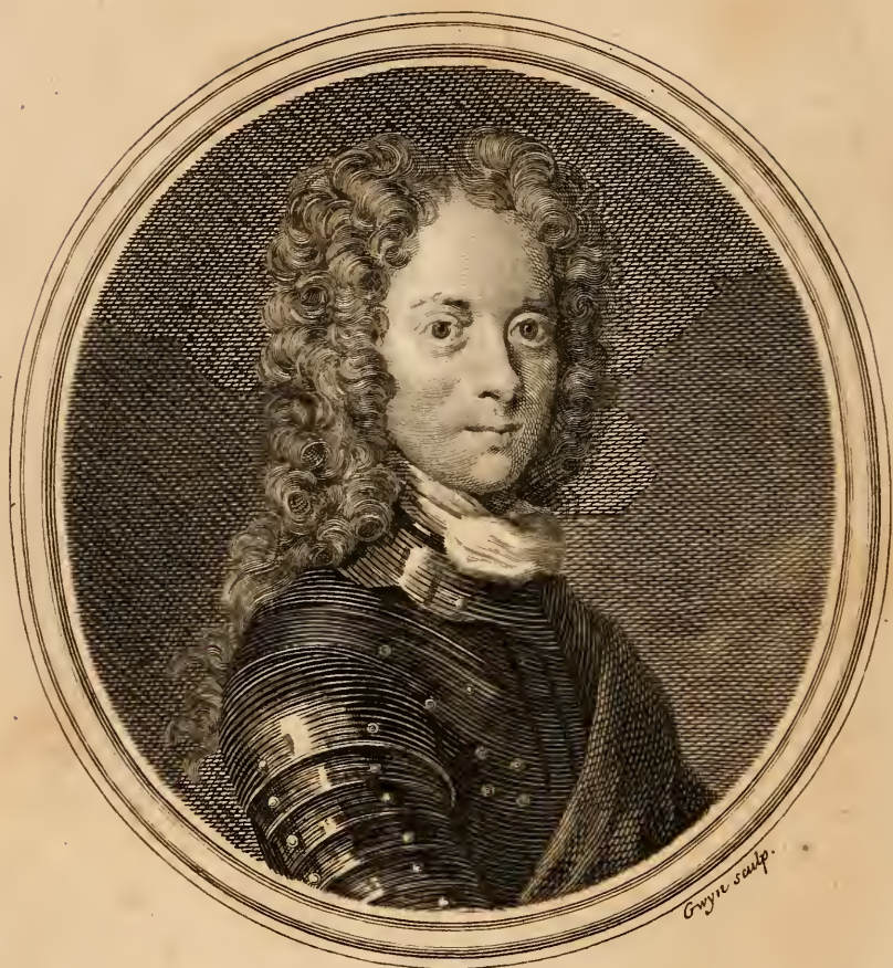
JOHN Duke of ARGYLL .