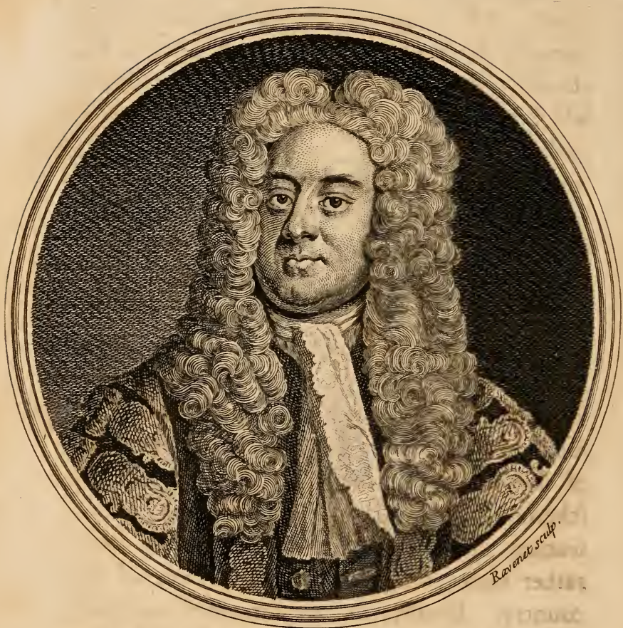
The Hon. ble ARTHUR ONSLOW.