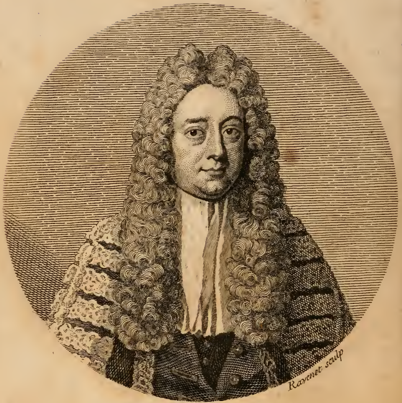
COWPER Lord CHANCELLOR.