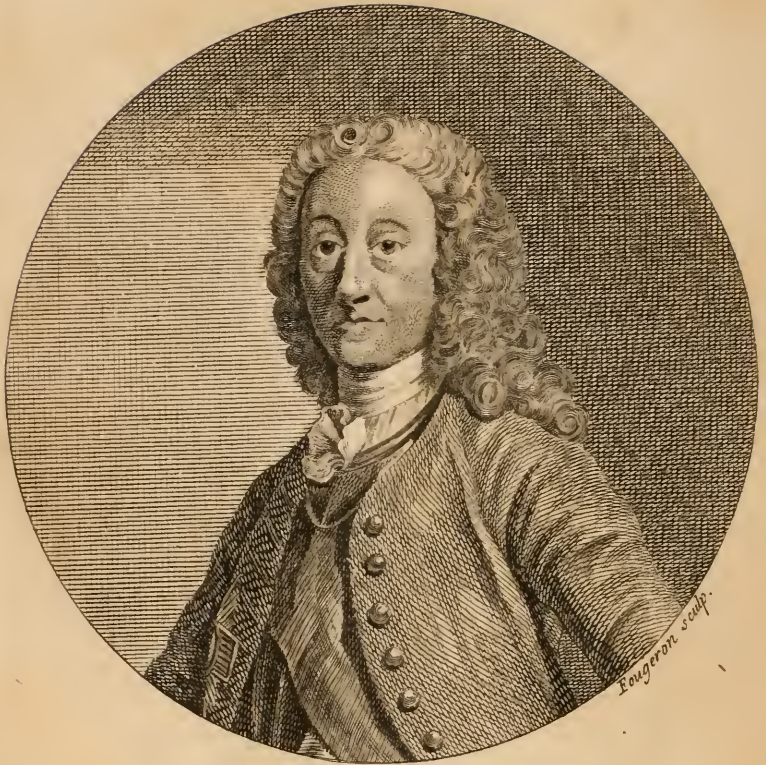
JOHN Earl of STAIR .