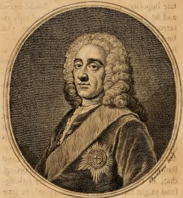
PHILIP Earl of CHESTERFIELD .