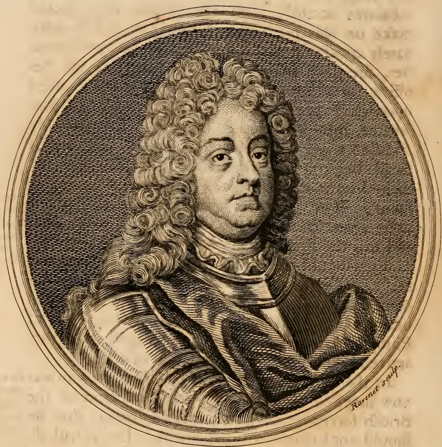
JAMES Duke of ORMOND .