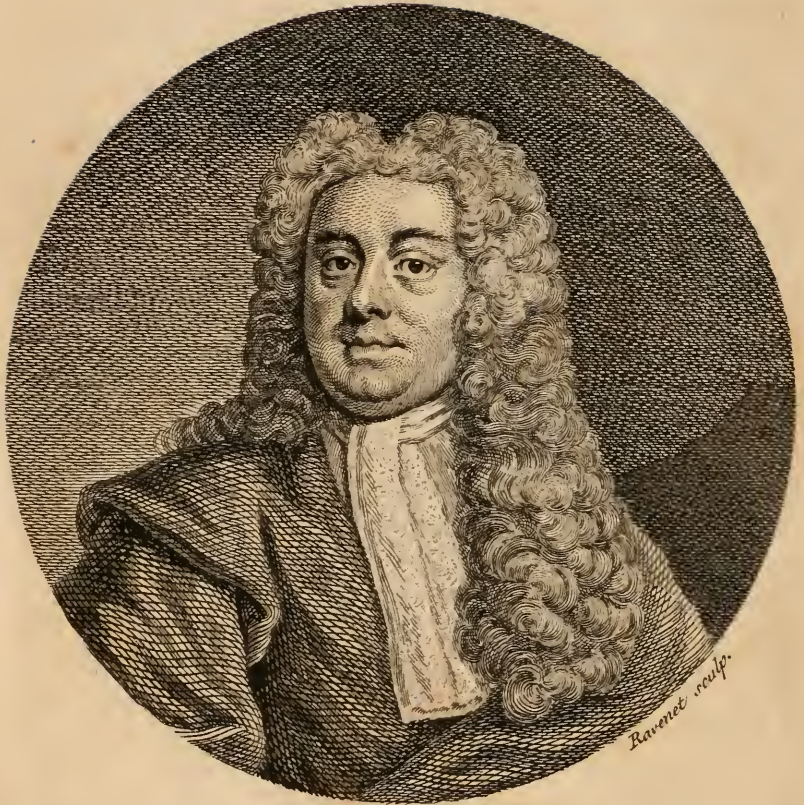
S r WILLIAM WYNDHAM Bar. t