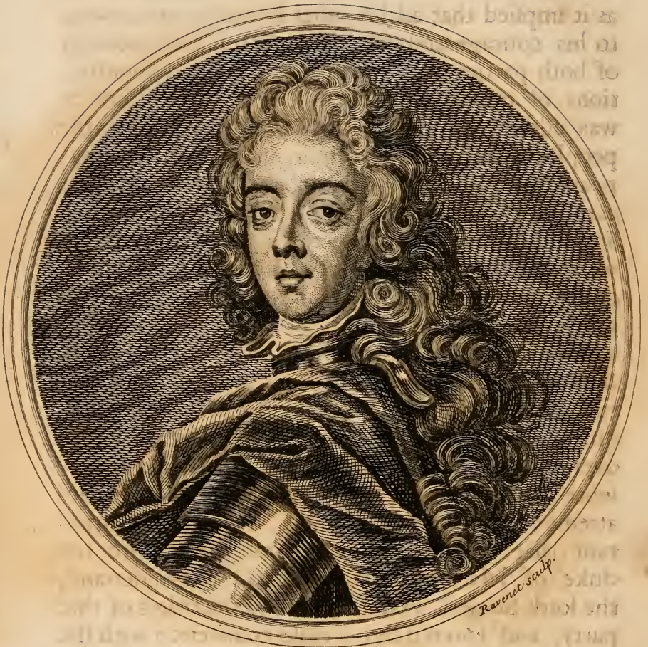
EUGENE Prince of SAVOY.