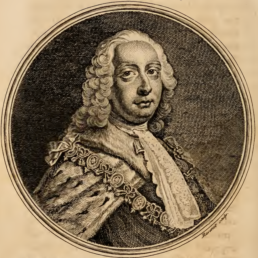
FREDERICK Prince of WALES .