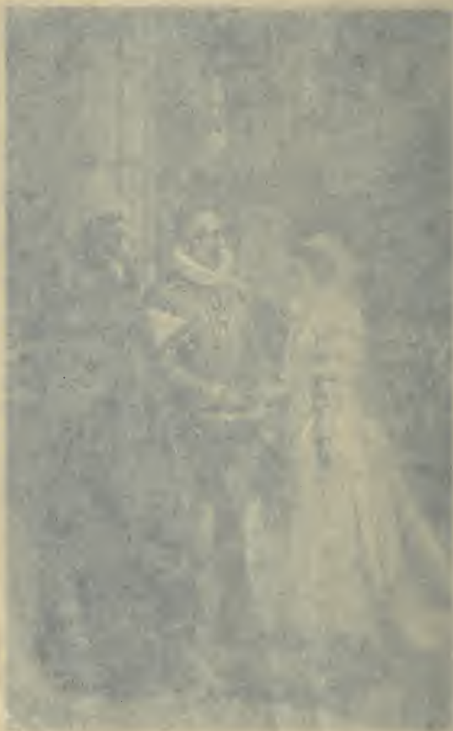
Marriage of William of Orange and Charlotte of Bourbon