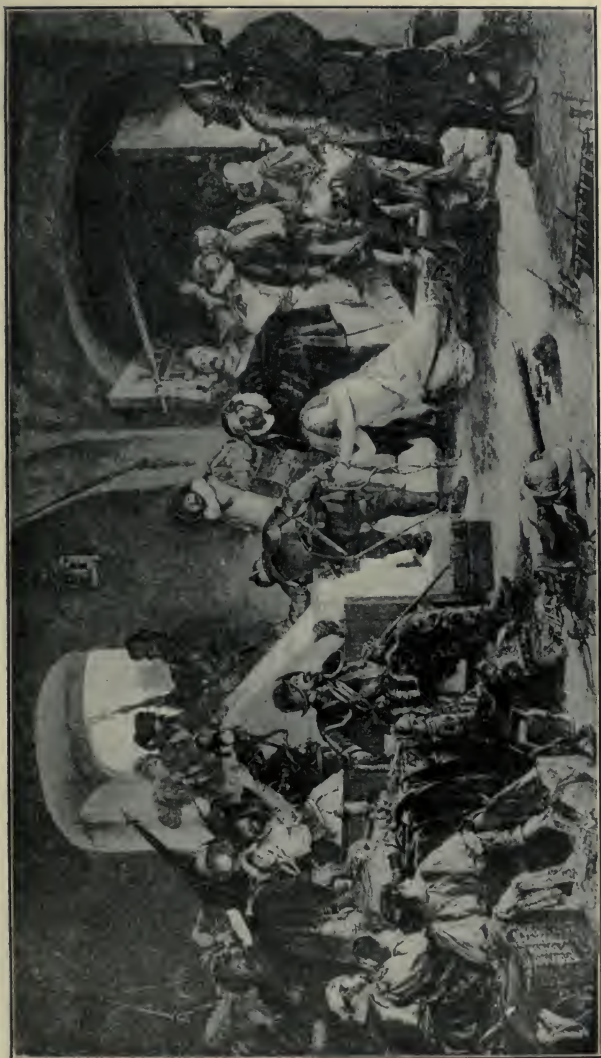
THE SPANISH FURY IN ANTWERP, NOVEMBER 4, 1576