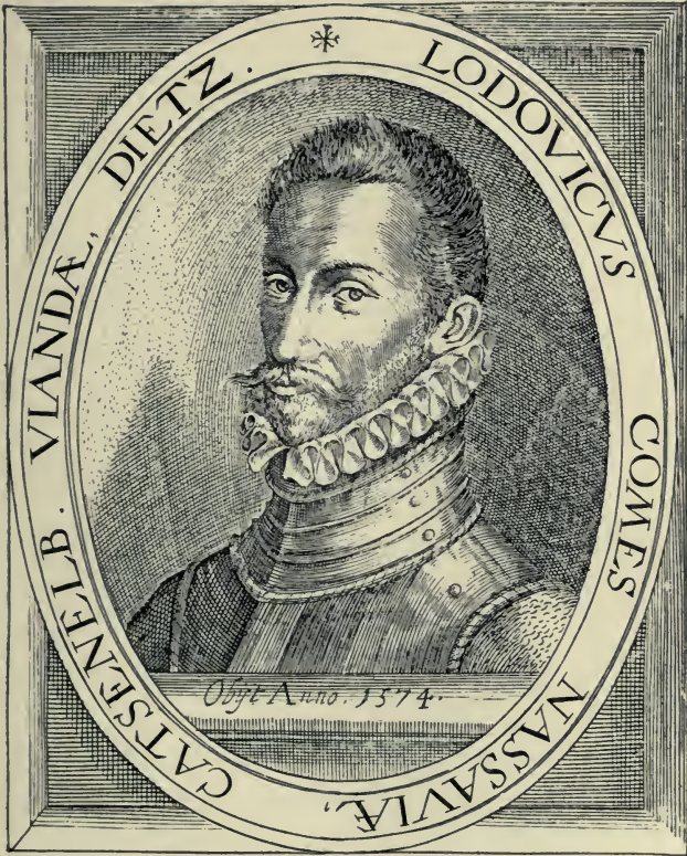
LOUIS OF NASSAU. After a contemporaneous engraving.