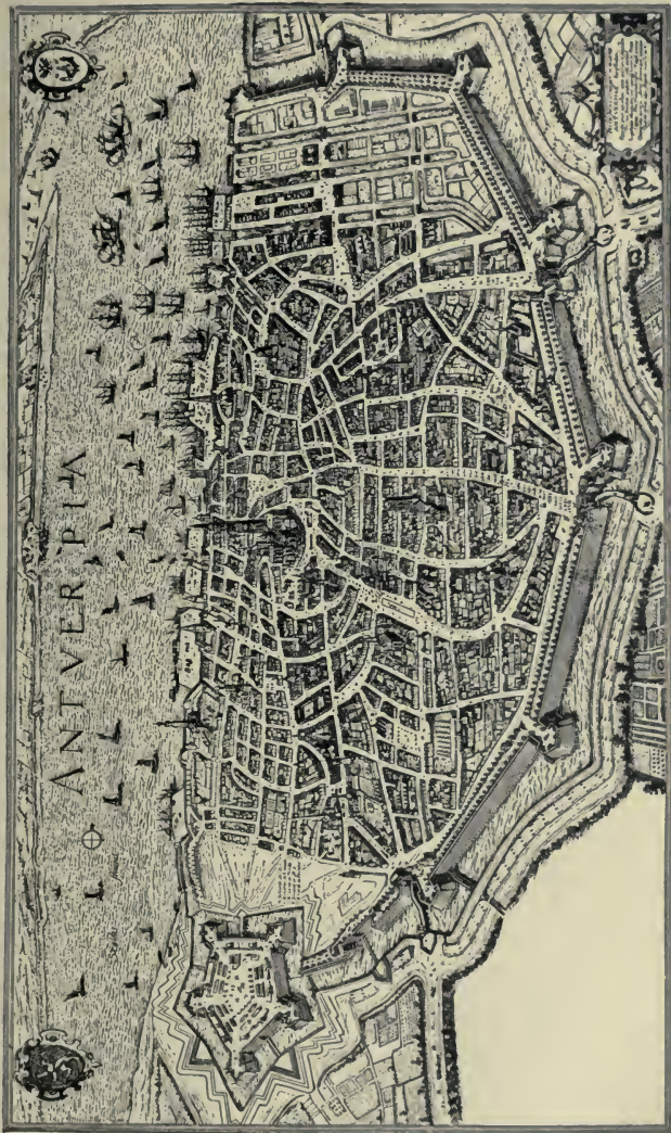
BIRD'S-EYE VIEW OF ANTWERP, SHOWING THE POSITION OF THE CITADEL ERECTED BY ALVA. Reduced fac-simile of the engraving in Braun's Städtebuch, 1572.