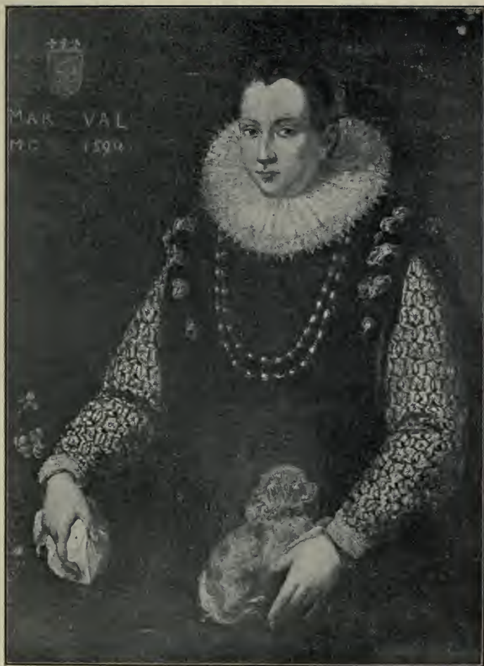
MARGARET DE VALOIS, QUEEN OF NAVARRE. Painting by François Clouet, called Janet; Chantilly.