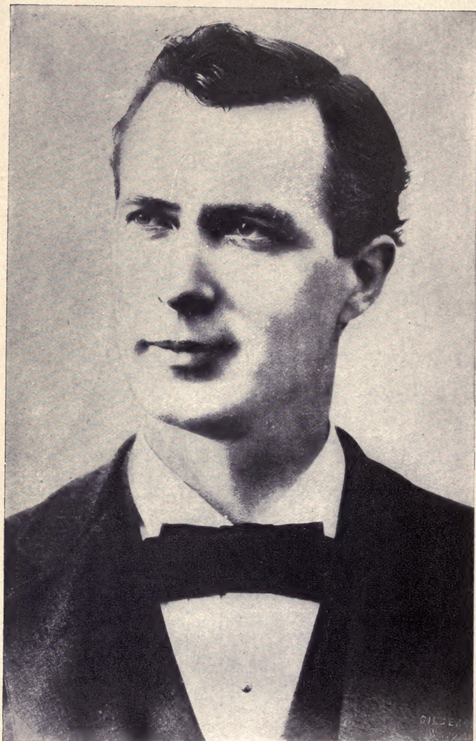
WILLIAM COWPER BRANN