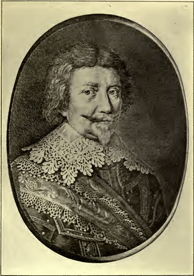
PRINCE FREDERICK HENRY