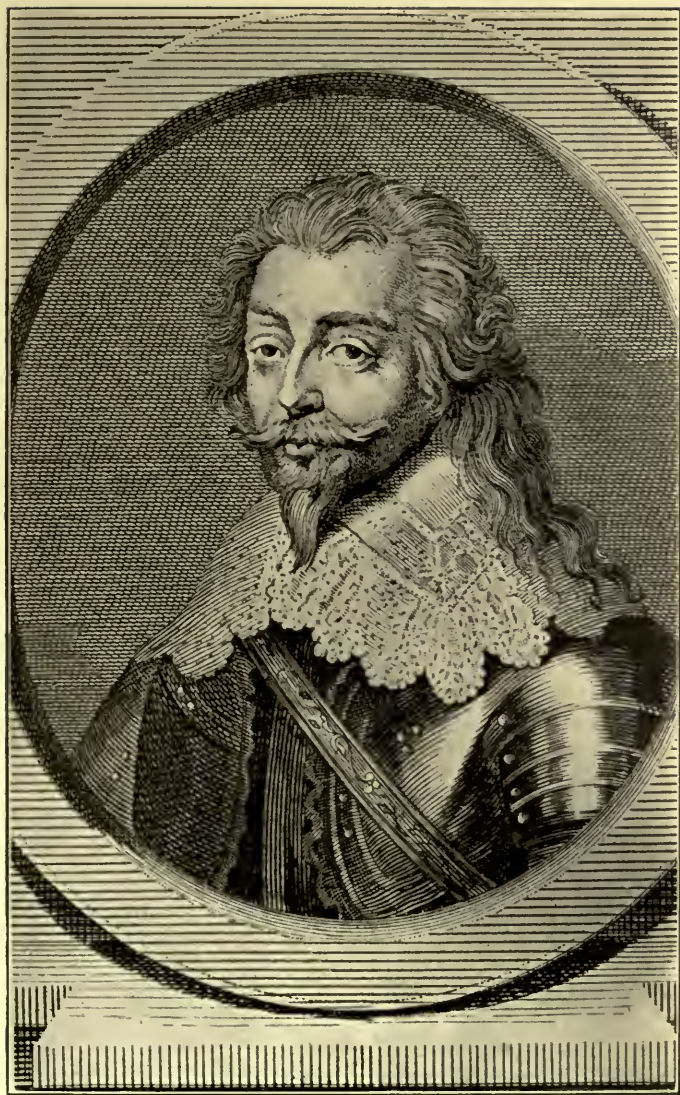
PRINCE OF CONDÉ