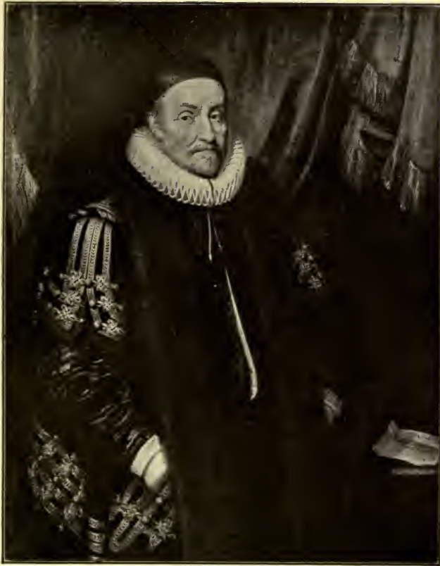
WILLIAM OF ORANGE.

Painting by M. J. Mierevelt, in the Rijks Museum, Amsterdam.