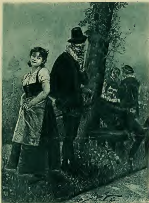
ARMADO AND JAQUENETTA. Love's Labour's Lost, Act I, Scene II.