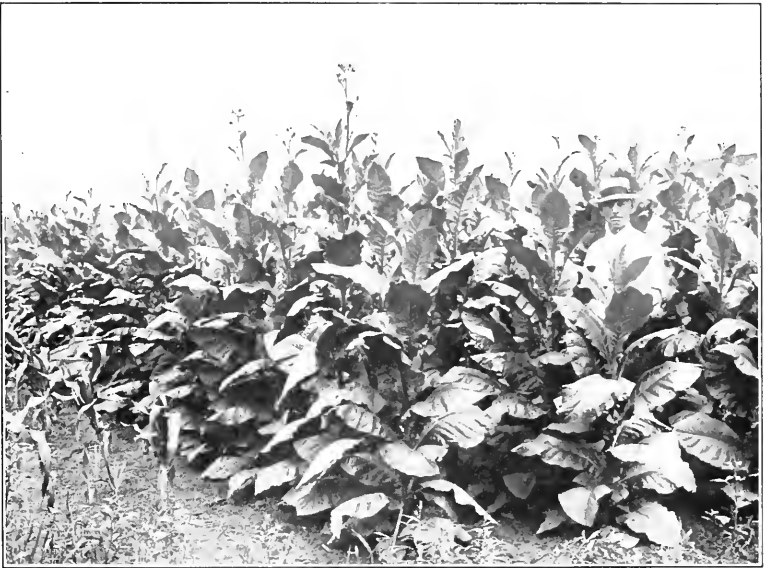
Figure 2. A field of Round Tip grown by Morgan & Dickinson, Windsor, Conn., in 1920, who say: "It showed wonderful growth, averaging 24 leaves to the stalk, and we were particularly impressed with the round shape of the leaves and the plant's root system."