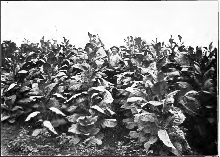
Figure 3. Round Tip plants grown by T. J. Kearney, Poquonock, Conn., in 1920, who was pleased with their vigorous growth and production of numerous and well shaped leaves.