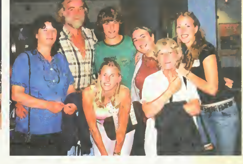
▲ It was time for celebration as new students were welcomed to the Tyndale family.