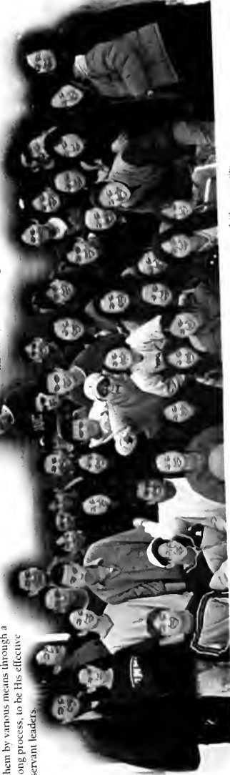
Youth from Mississauga Chinese Baptist Church engage in culturally relevant ministry in a strong faith community.