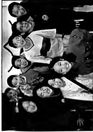
Good friendships help ethnic youths build positive identities and balance hardships of home and their host society.

Similarly, sociologists have discovered that not all ethnic youths are alike, though they belong to the