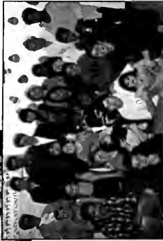
Workers and single parent families from "Just Me & the Kids."

For thirty years, I have ministered to boys and girls who come from every kind of background, you could possibly think of in our Canadian culture. Over this thirty year period, I have seen over and over again the effects of physical, sexual, emotional abuse and