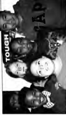
Children from single parent families.

What is the Father's heart for those whose families have been left in turmoil? Deuteronomy 24:19-22 says "When you are harvesting in your field and you overlook a sheaf, do not go back to get it. When you beat the olives from your trees...when you harvest the grapes in your vineyard, do not go over the vines again. Leave what remains for the alien, the fatherless and the widow so that the Lord your God may bless you in all the work of your hands. Remember that you were slaves in Egypt. That is why I command you to do this."