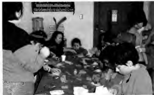
▲ Craft time with Curve Lake kids.

Some two hours north of Toronto, beyond Peterborough, is Curve Lake Indian Reserve, home of the Ojibwa people. During the March reading week, eight seminary students participated in a mission trip to Curve Lake where, in partnership with Curve Lake Christian Assembly, they led vacation Bible school for the reserve’s young residents. The trip was facilitated by