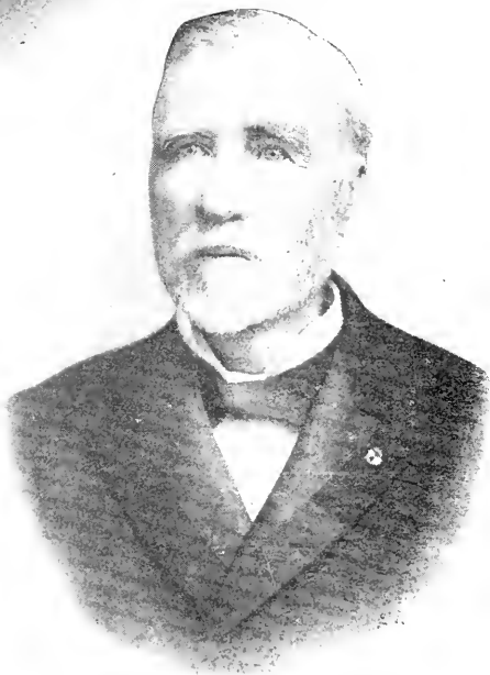
JOHN CORSON SMITH, 33 Grand Minister of State