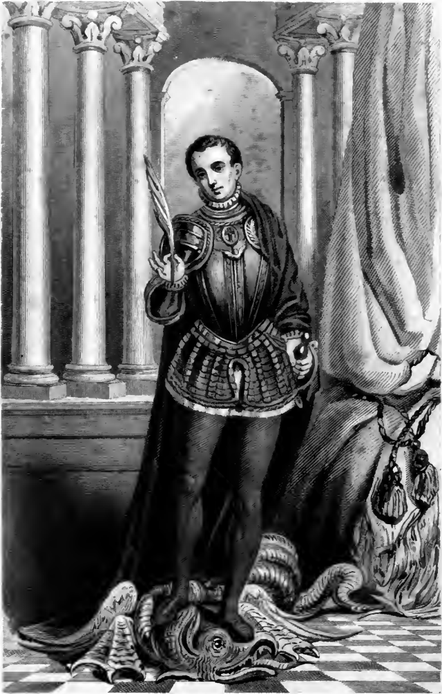
Painted by Isaac Combauro