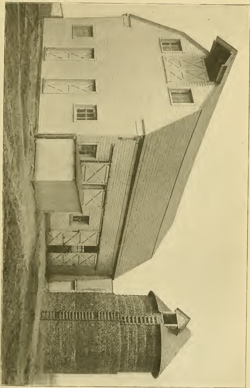
THE STATION BARN AND BRICK SILO. (FIG. 1.)