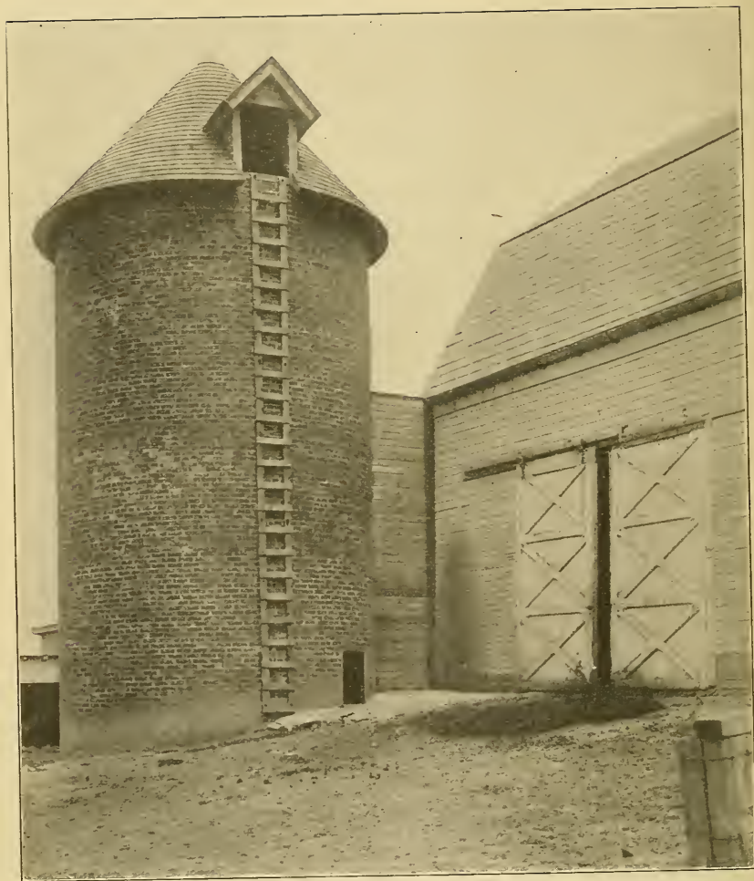
A REINFORCED BRICK SILO