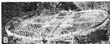
FIG. 1.—Biological Survey cage trap for taking beavers alive. A , Trap held partly open to show construction. B , Trap set and ready to be placed in the water. The trigger stands erect in the center of the set trap 10 to 12 inches high, so that when struck on any side by a swimming beaver it releases trigger bars and springs, and then the trap jaws close and lock above the captive animal. Details of construction shown in Figure 2