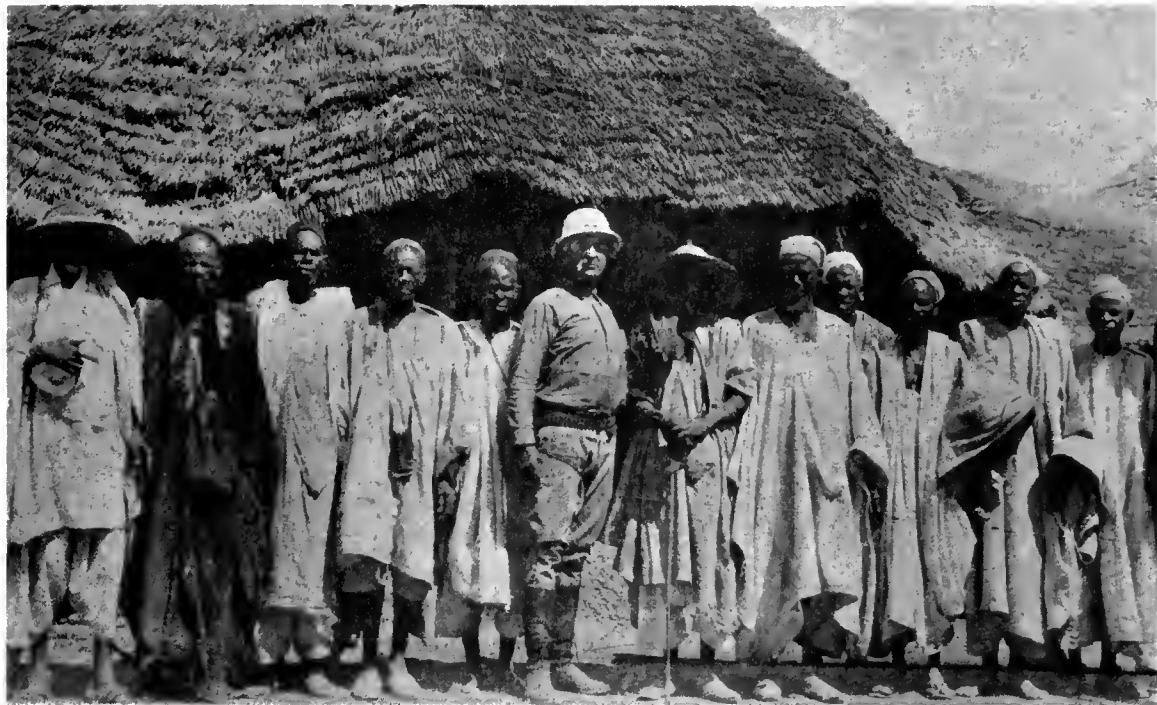
Africa Safari - 1923