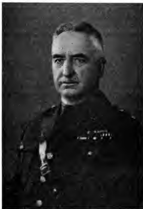
Major General of 40th Division, National Guard, 1938