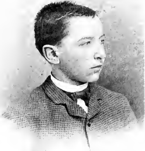
Life in the Ojai- About age 14