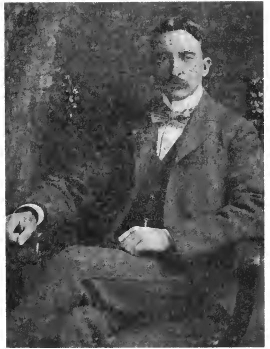
As a teacher in San Diego 1899