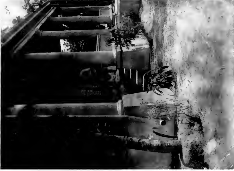
Photographs to left and above: The family in Manila, Philippines, ca. 1908.