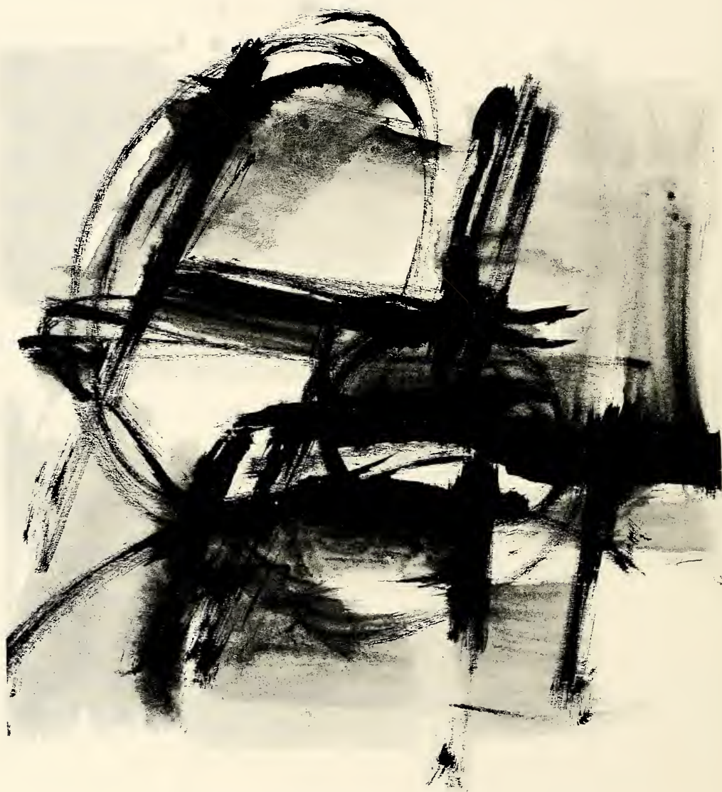
CAROLYN HARRIS. INK DRAWING 3. Brush with ink, 16 x 18 inches.