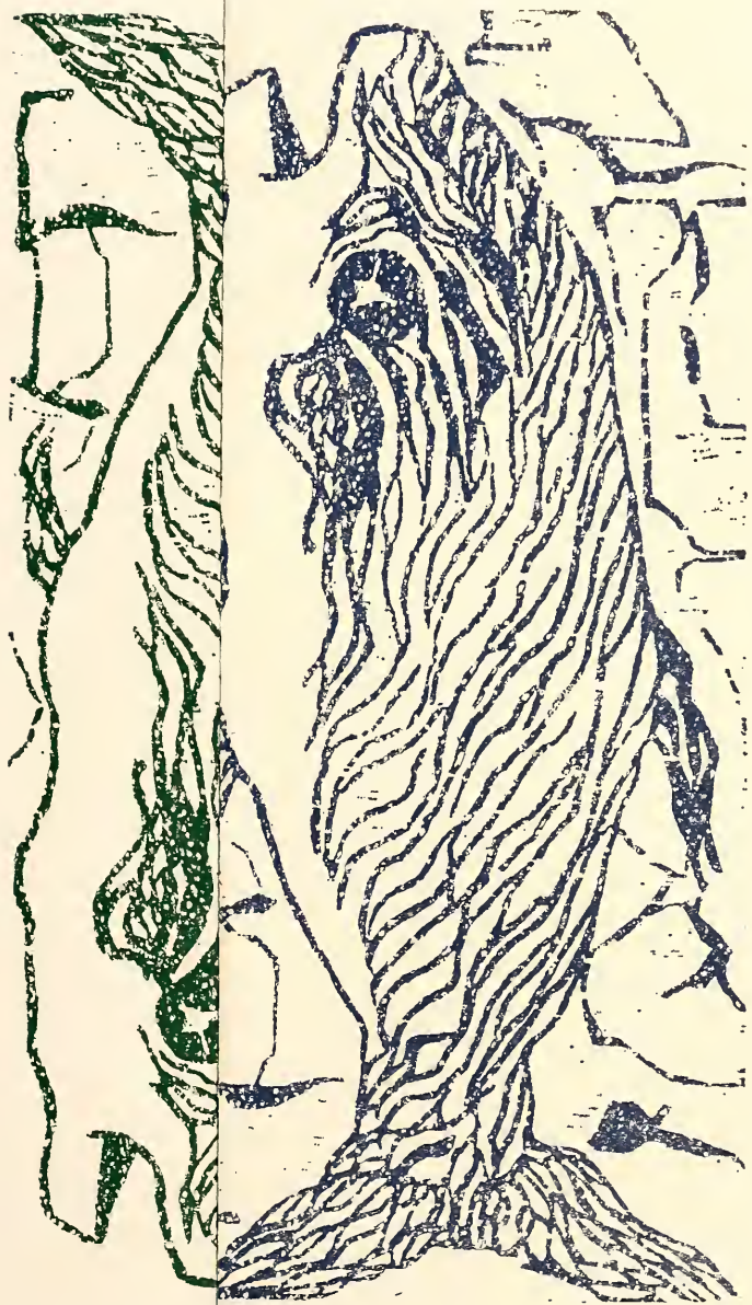
NANCY NEIL. A SYMBOL. Woodcut, 20 x 3 1/2 inches.