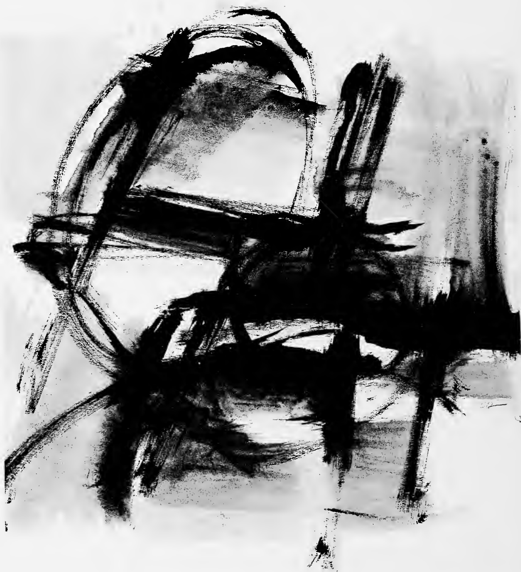
CAROLYN HARRIS. INK DRAWING 3. Brush with ink, 16 x 18 inches.