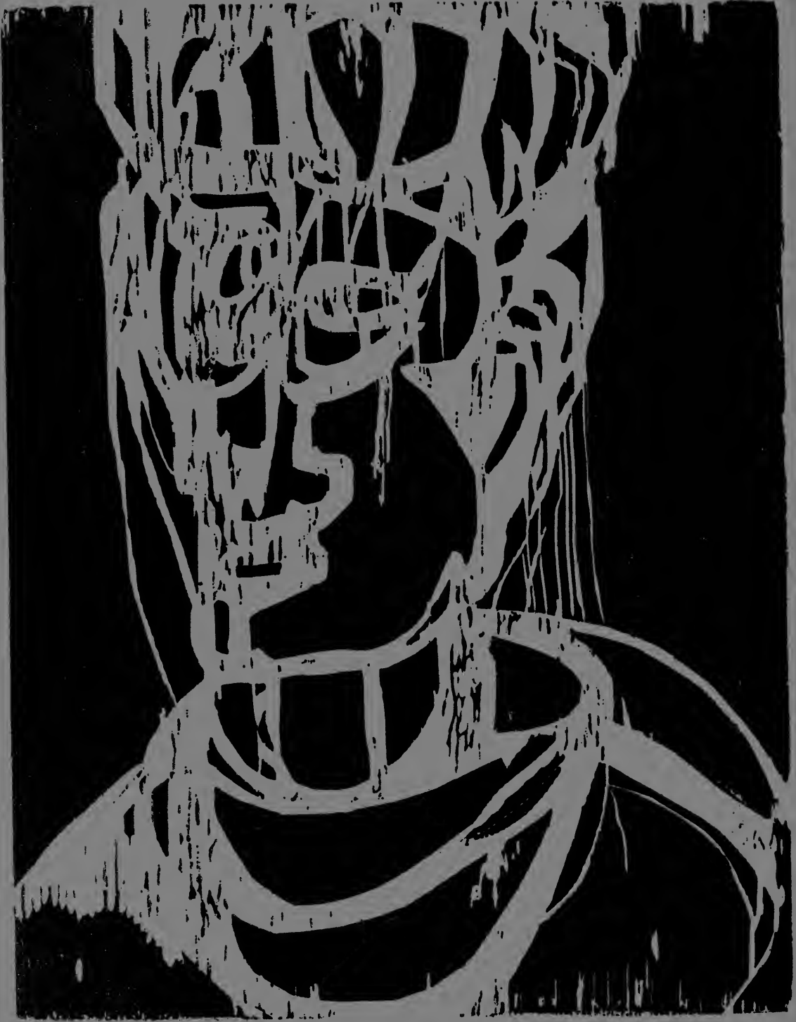
MARNIE SINGLETARY. HEAD OF CHRIST. Woodcut, 11 x 14 inches.