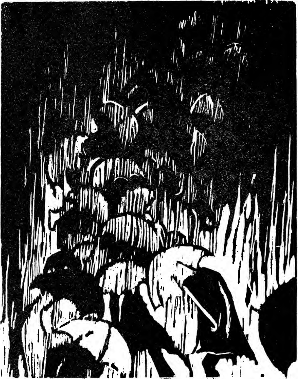
WOODCUT JEAN ELLEN JONES