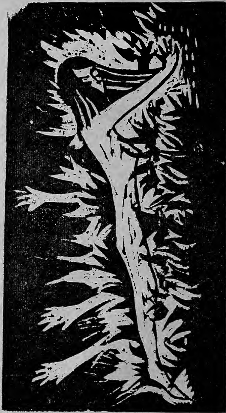
FOR FROST'S "TO EARTHWARD" WOODCUT MARGIE WEST