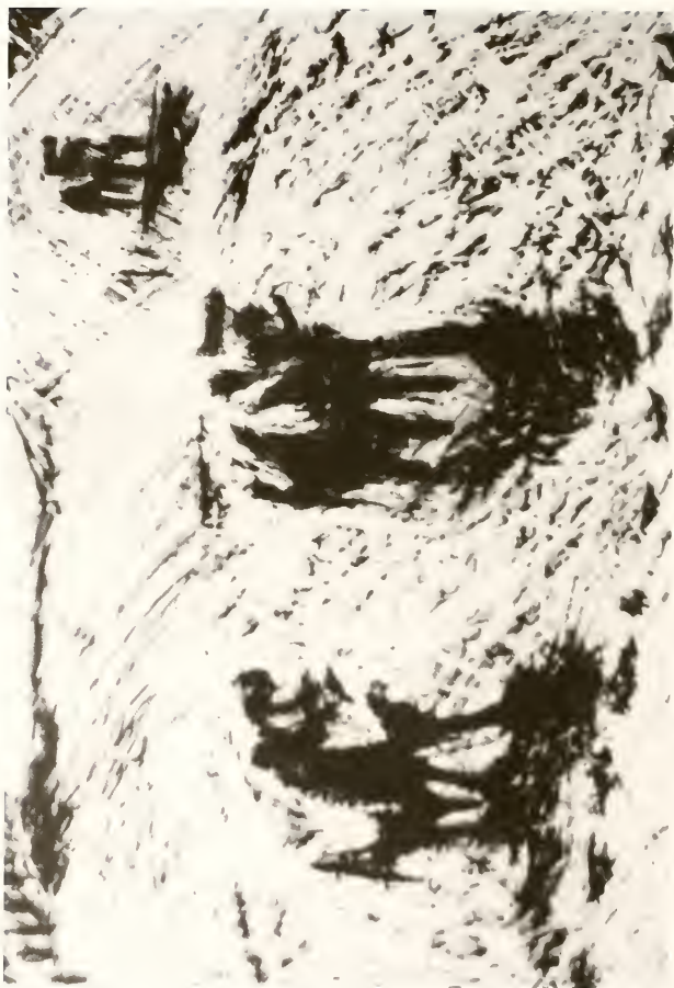
ElizabethCore: 220 North, lithograph