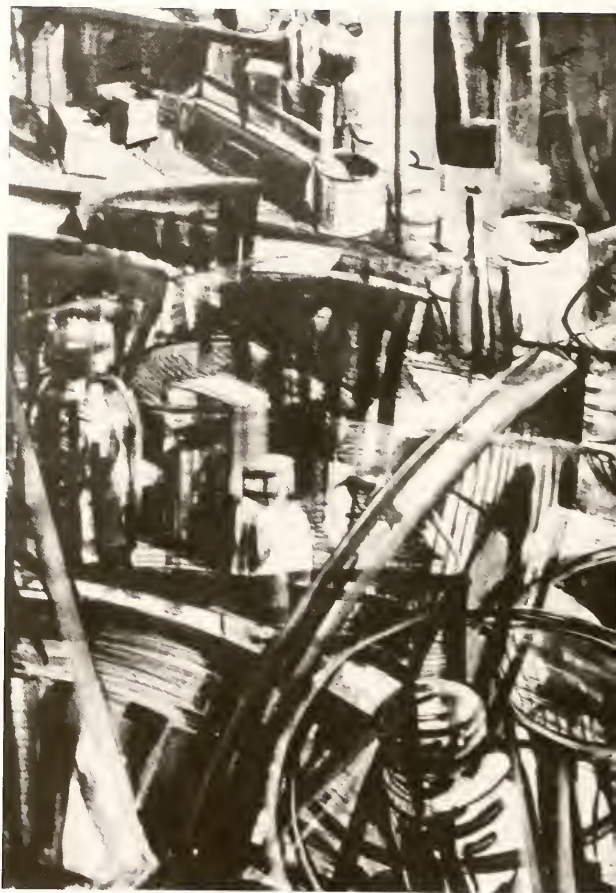
Roger Goldenberg: Untitled , lithograph