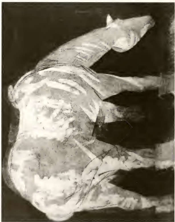
Billy Hanes: Untitled , etching with aquatint