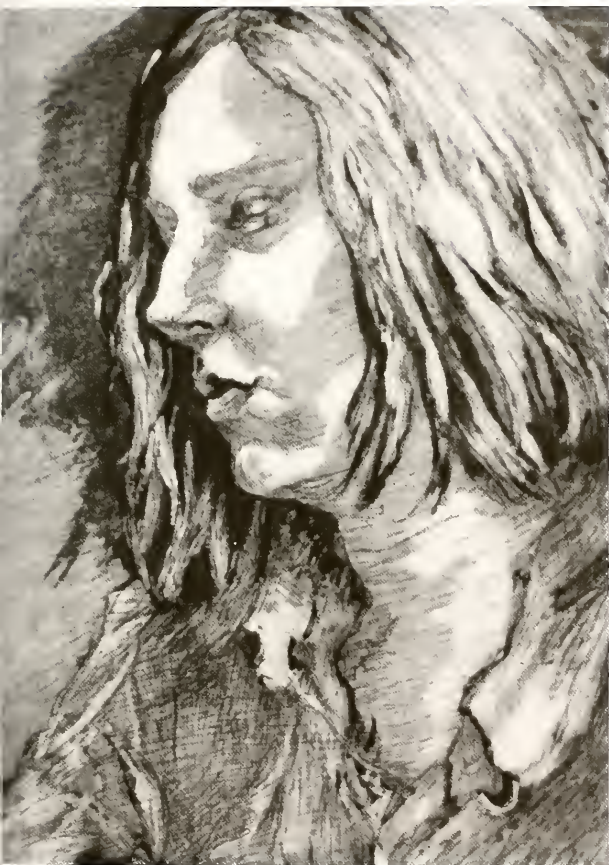
Karen Ingram: Untitled , etching with aquatint