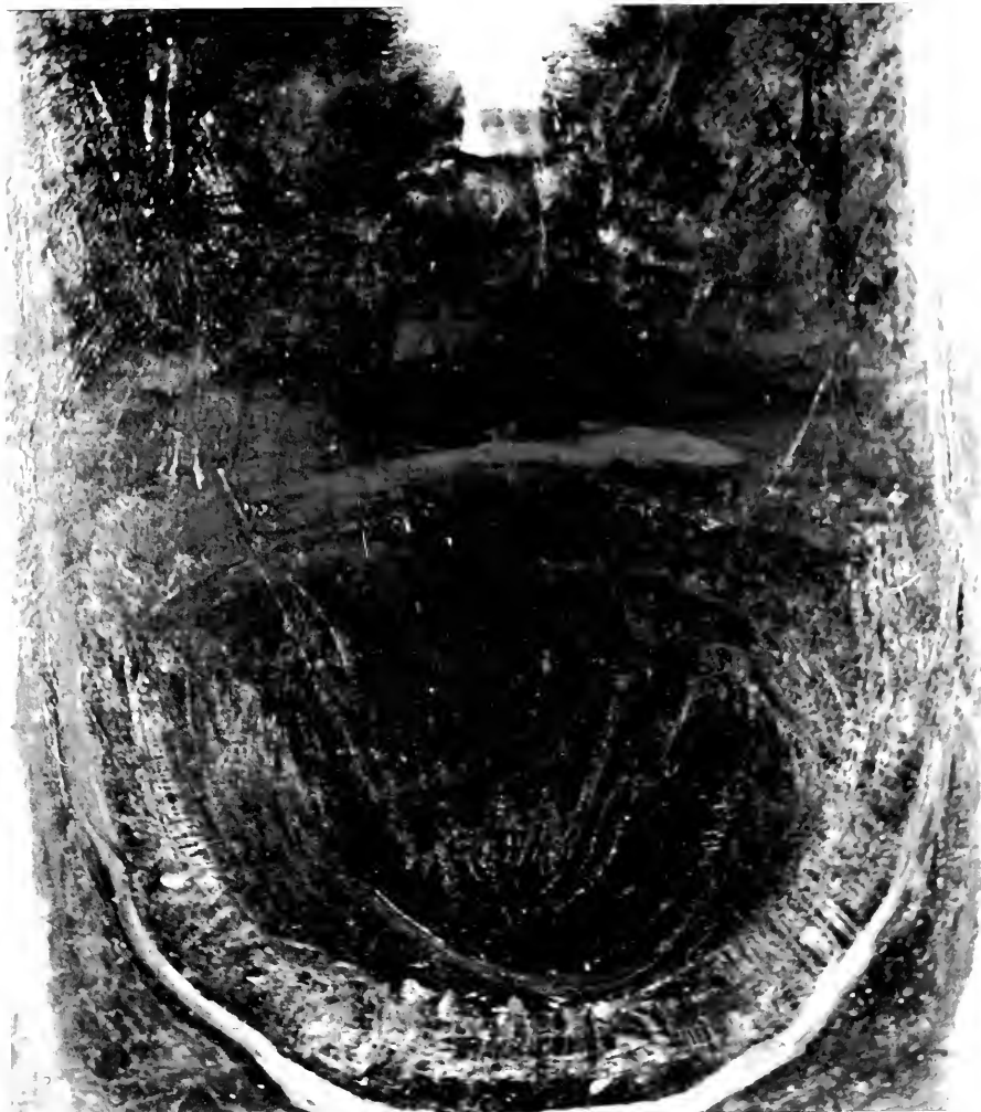
Night Light, (First Place), Oil on Canvas*