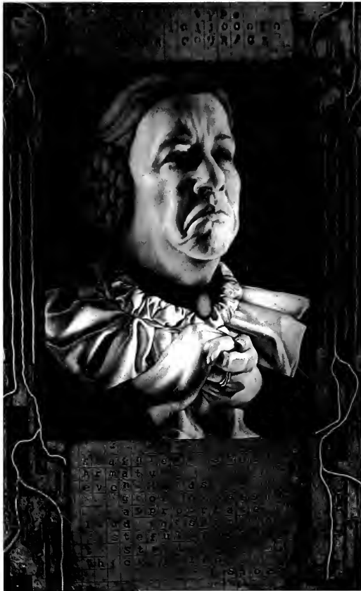
Mother Courage , Mixed Media on Paper