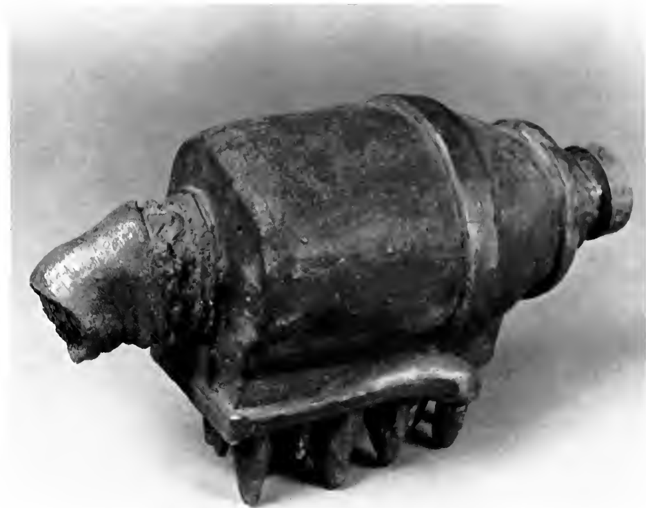
Untitled, (Third Place), cast metal