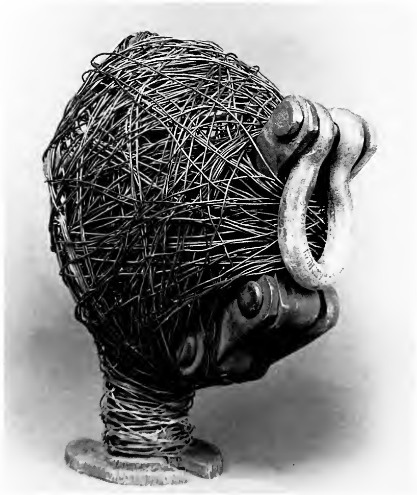
Steel Presence, steel, found objects