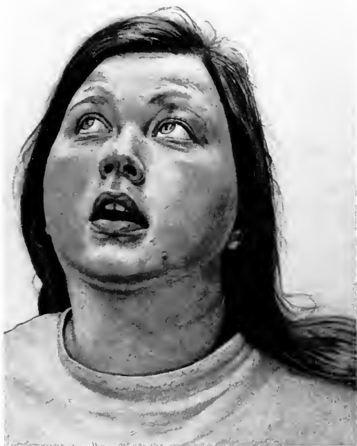
Some Days and Others. (Second Place), graphite on paper*