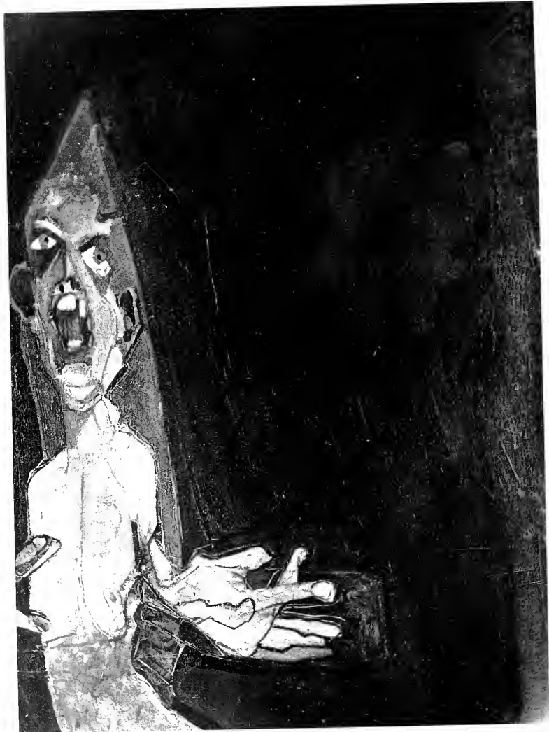
The Painter, acrylic on canvas*