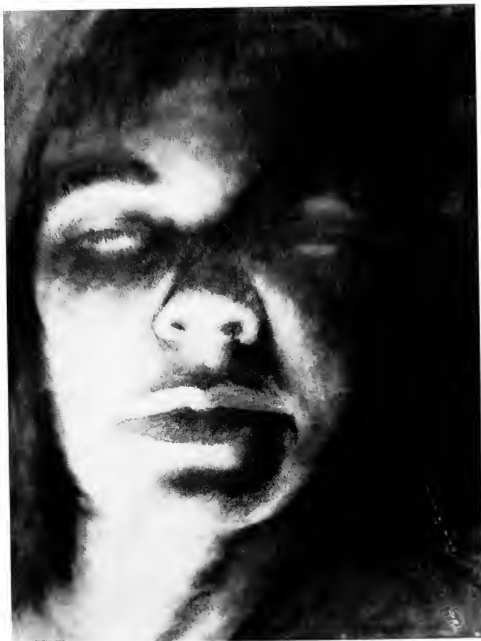
Self-Portrait. pastel on paper*