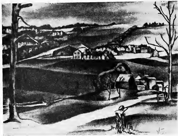
LANDSCAPE — VIRGINIA JACKSON