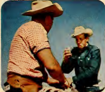
Herding steers across the range you'll find a man