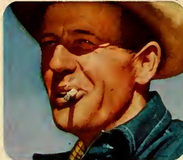
That you're smokin' smoother and you're smokin' clean!