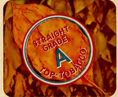
Top-tobacco, straight Grade-A, Top-tobacco all the way!