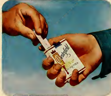
Takes big pleasure when and where he can... Chesterfield King!