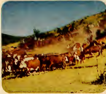
Driving cattle! Desert sun ablaze!

Live-action shots— Saddle Mountains, Wash.