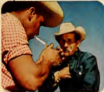
This sun-drenched top-tobacco's gonna mean...