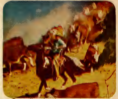
Pounding leather rounding up the strays!