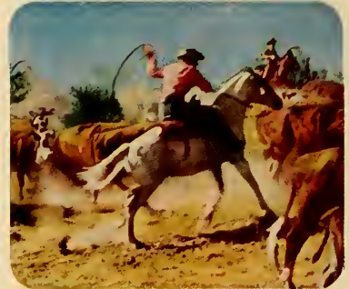
Only top-tobacco, full king-size, For big clean taste that satisfies!

Join the men who know— NOTHING SATISFIES LIKE THE BIG CLEAN TASTE OF TOP-TOBACCO