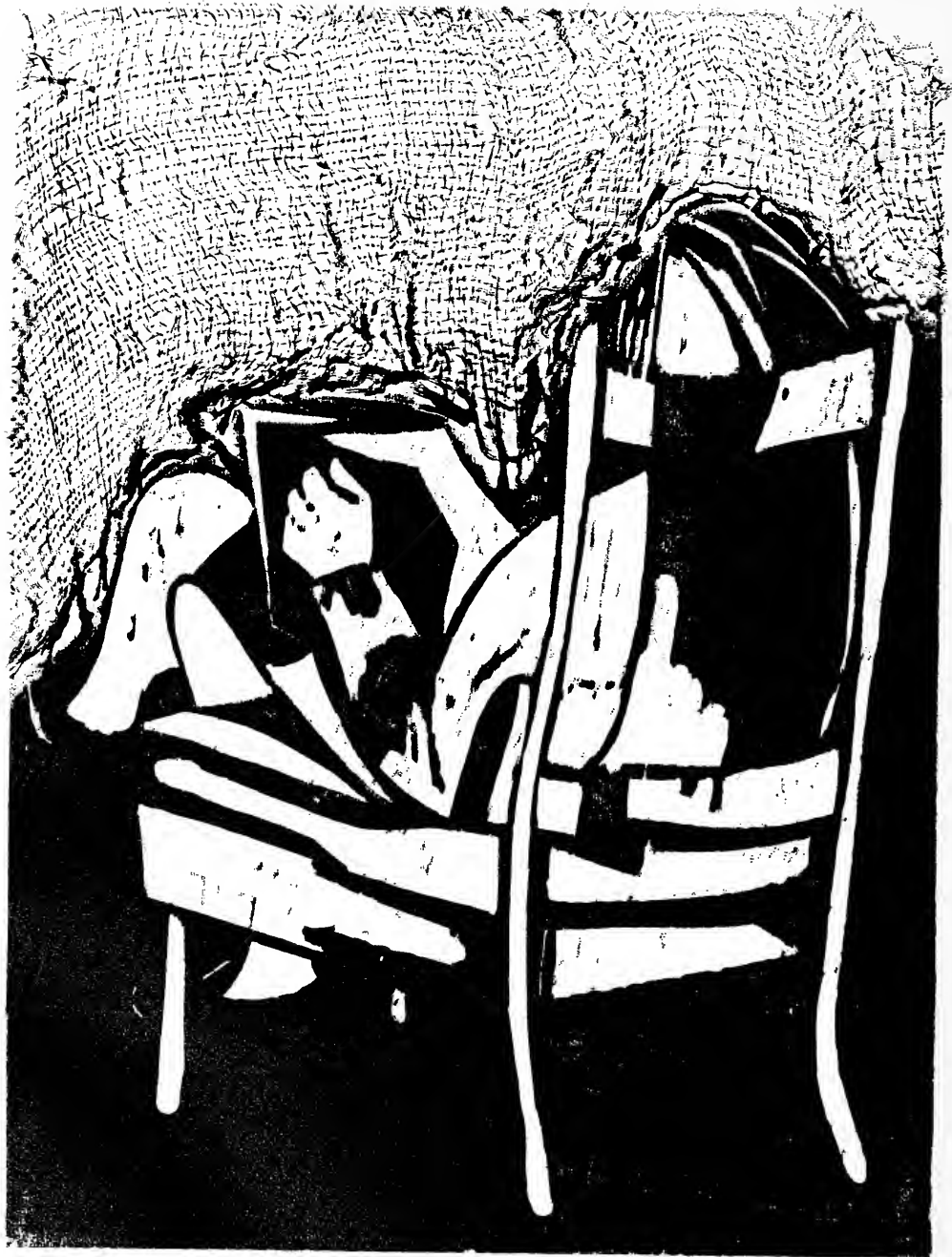
WOODCUT REBECCA BARHAM