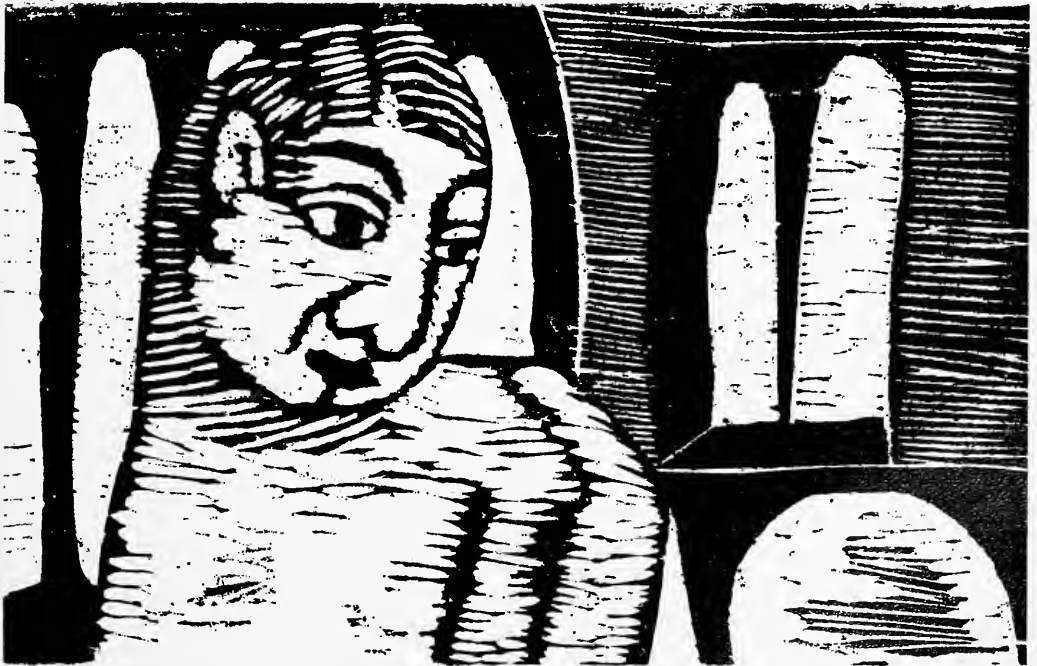
WOODCUT INA VON McINNIS