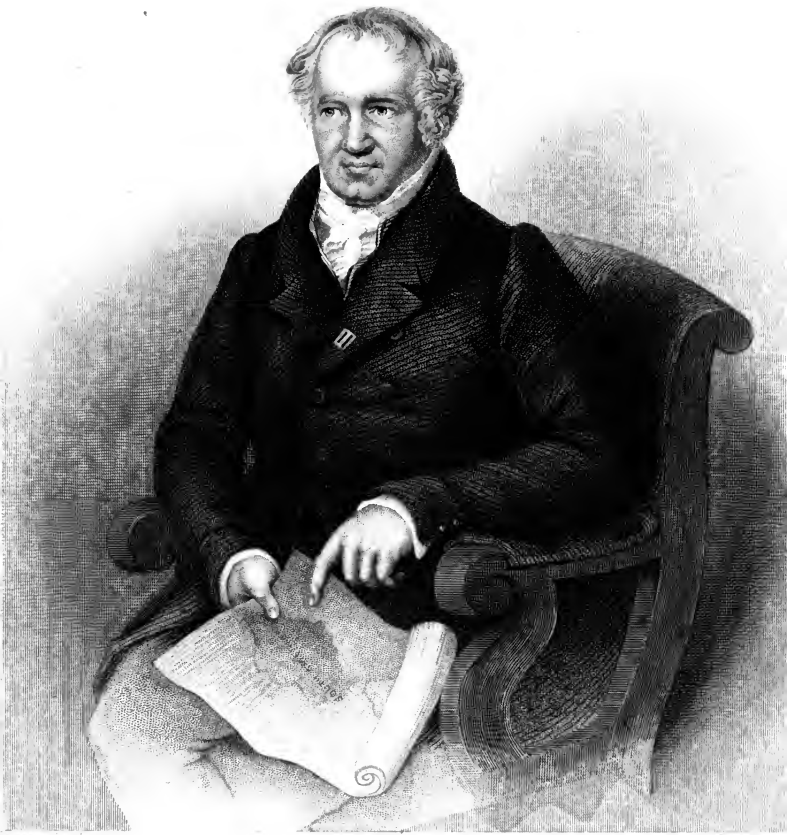
Alexander von Humboldt.