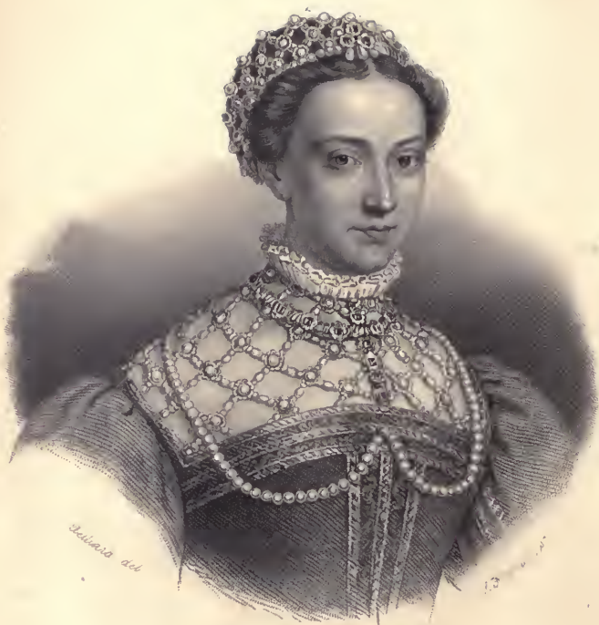
THE DUCHESS D'ETAMPES.