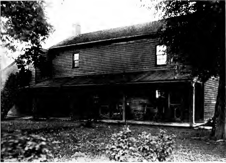
HOME OF HON. CORNELIUS CORTRIGHT (6), PLAINS, LUZERNE COUNTY, PA.