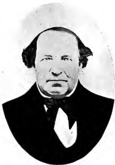
JOHN ABBOTT b. 1800, d. 1861