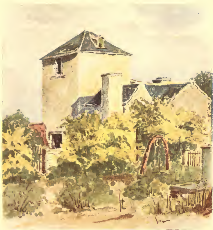
A CORNER OF THE MANOIR OF KREMARZÉ