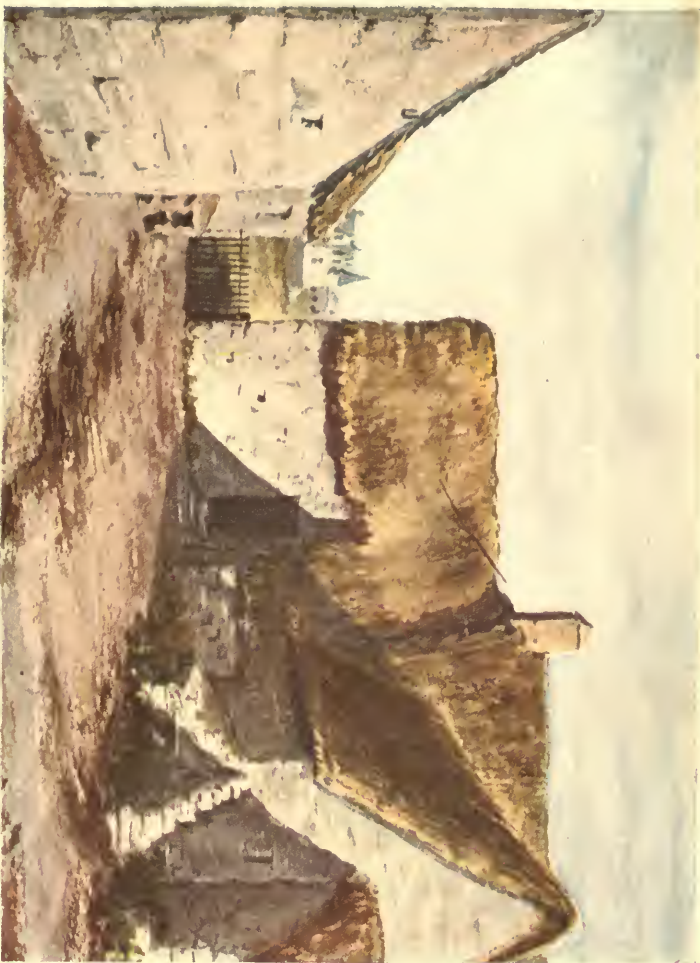
THE CHATEAU DE ROZKAVEEL