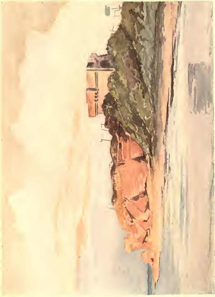
THE WATCH-TOWER OF FORT ROZKAVEL