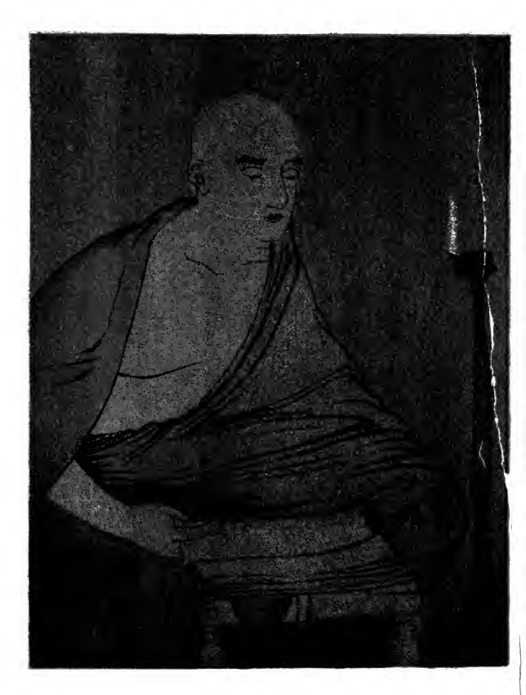
The Indian Story-Teller at Nightfall.