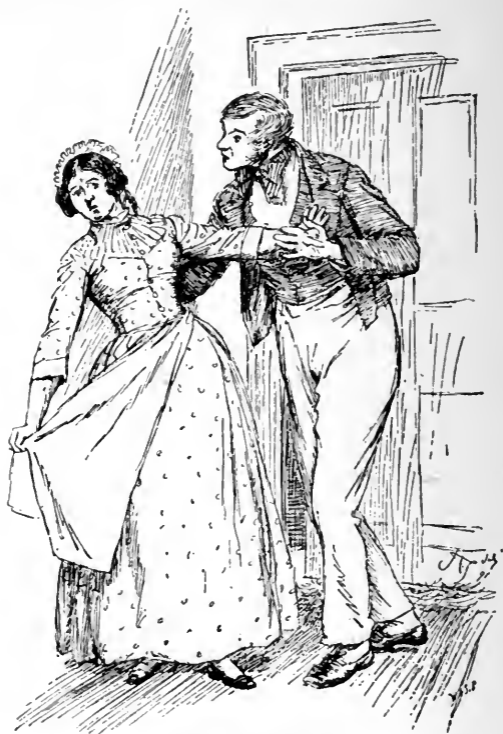
"Soothed by her lover."

the note, "with Miss Pole's kind regards," it needed no wizard to find out who sent it; and if the writer's name was to be kept secret, it was very well that I was alone when Martha delivered it.