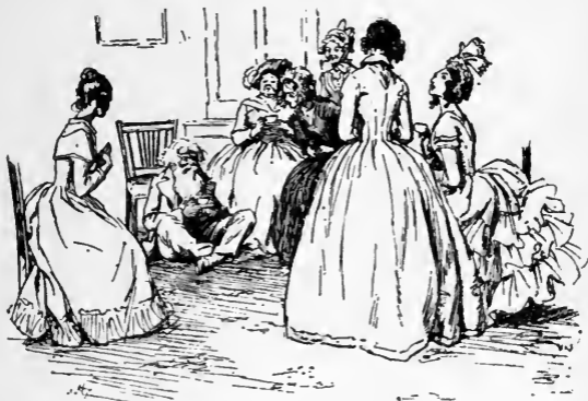
"The Father of the Faithful."

One day, at a select party in his honour, which Miss Pole gave, and from which, as Mrs. Jamieson honoured it with her presence, and had even offered to send Mr. Mulliner to wait, Mr and Mrs. Hoggins