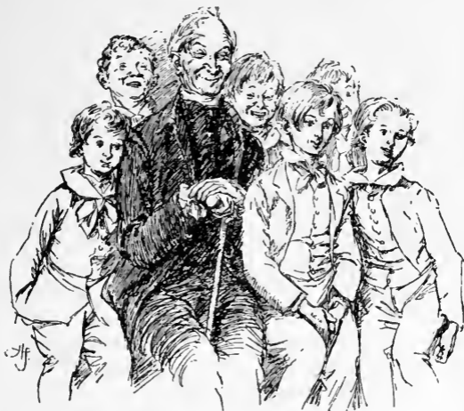
“The Church smiling approval.”

“Will you look, my dear—you are a stranger in the town, and it won't give rise to unpleasant reports