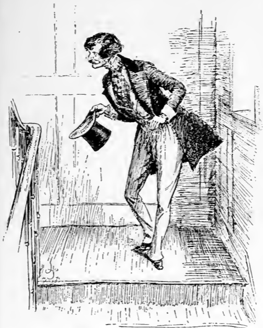
"Making such a graceful bow."

on the stairs, coming now forwards from the inner part of the room, to which there is no entrance — you remember, Miss Matty — and just repeating, in his pretty broken English, the inquiry if I had any business there — I don't mean that he put it quite so bluntly, but he seemed very determined that I should