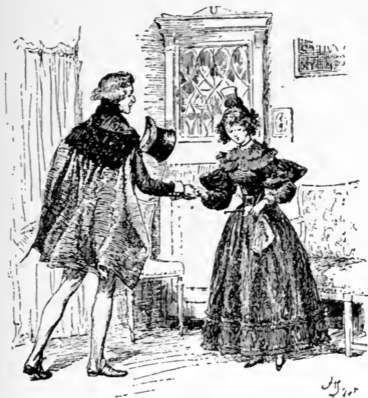
"He shook hands with Miss Jessie."

how he had served in the same regiment with Captain Brown, and had become acquainted with Miss Jessie, then a sweet-looking blooming girl of eighteen; how