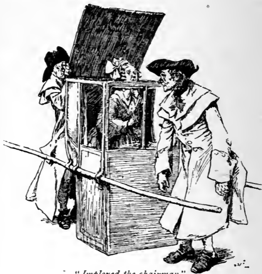
" Implored the chairman. "

before being shut down in the sedan, like jack-in-a-box, implored the chairman, whatever might befall, not to run away and leave her fastened up there, to be murdered; and even after they had promised, I saw her tighten her features into the stern determina-