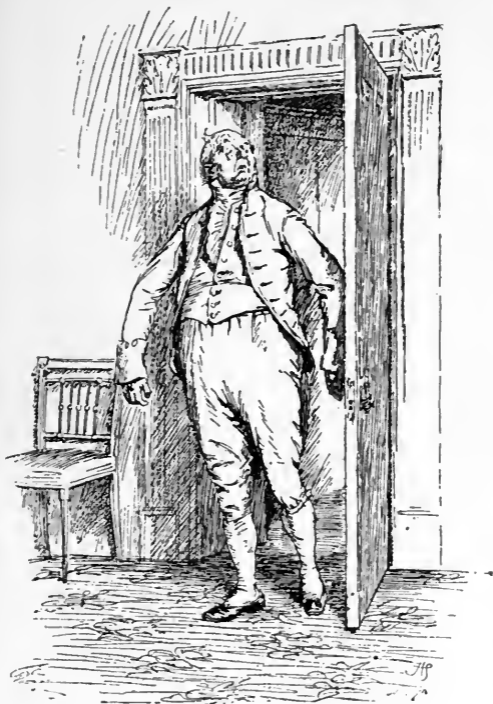
"In dignified surprise."

telligent and sensible as Carlo, and felt as if insult were added to injury when we were called upon to admire the gratitude evinced by his wagging his tail for the cream which should have been ours.