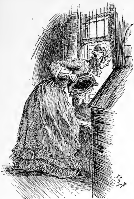
"Armed with a footstool."

"Take care of that!" said she to me, as I offered to relieve her of her basket. "It's my plate. I am sure there is a plan to rob my house to-night. I am come to throw myself on your hospitality, Miss Matty. Betty is going to sleep with her cousin at the