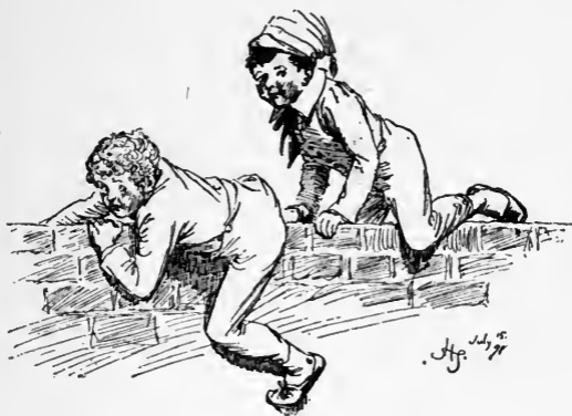
"The boys who stole the apples."