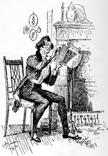
“The account of the ‘swarry.’”

“Just allow me to read you a scene out of this month’s number,” pleaded he. “I had it only this morning, and I don’t think the company can have read it yet.”