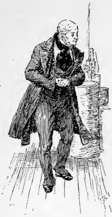
"The civil Mr. Johnson."

silently. I am ashamed to say, I believe I was rather vexed and annoyed at Miss Matty's conduct in taking the note to herself so decidedly. I had so set my heart upon her having a new silk gown, which she wanted sadly; in general she was so undecided anybody