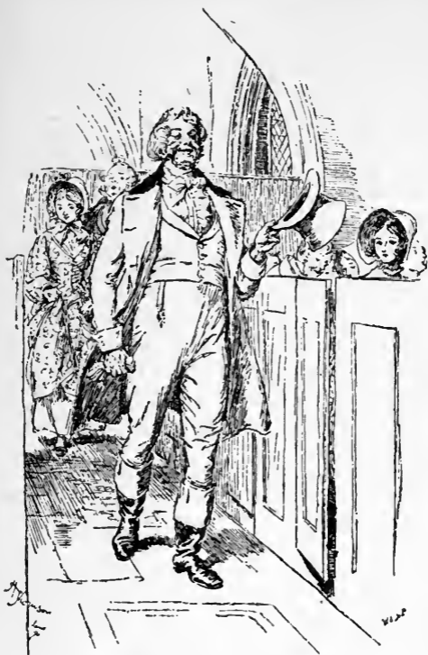
"Mr. Hoggins looked radiant."

We wished to ignore the whole affair until our liege lady, Mrs. Jamieson, returned. Till she came back to give us our cue, we felt that it would be better to consider the engagement in the same light as the