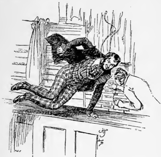
"Over the counter."

The young men at Mr. Johnson's had on their best looks, and their best cravats, and pivoted themselves over the counter with surprising activity. They