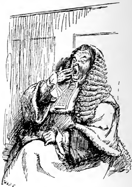
"Preached before some judge."

was a longing for a white "Paduasoy" — whatever that might be; and six or seven letters were principally occupied in asking her lover to use his influence