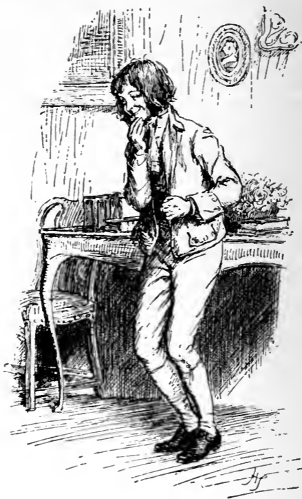
"The little curtseys."

town wanted something to talk about; but I don't think they did. They had the St. James's Chronicle three times a week, just as we have now, and we have plenty to say; and I remember the clacking noise