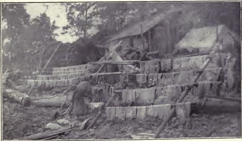
INDIANS DRYING SALMON. White Salmon River, Wash., 1912.

As a last forlorn hope, the Yakimas have submitted an appeal to the Attorney General to institute suit for the recovery of their stolen