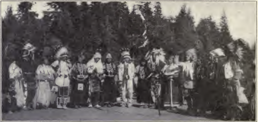
SOCIAL DANCE OF THE YAKIMA.

erty and dying from whiskey and disease. We want you to help us. * * * * If we sell our land, we will have no place to go. We cannot live among the whites."