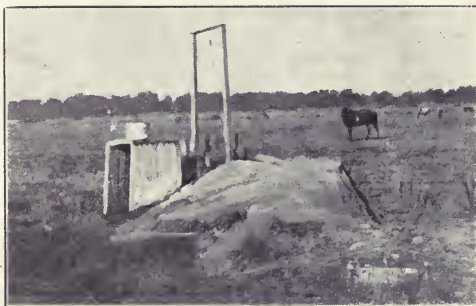
SUB-IRRIGATED MEADOW. Yakima Indian Reservation. Well and Sweat House.

"Purely agricultural lands similar in character to these and in the same neighborhood are now worth from $150 to $800 per acre. * * * They produce alfalfa from three to four crops a year; hops, a ton and a quarter per acre; potatoes and vegetables of all kinds; the finest of apples, peaches, pears, plums, apricots, prunes, and fruits of all kinds other than tropical or semitropical. With water these lands will be just as valuable and produce the same kind of crops. They lie adjacent to