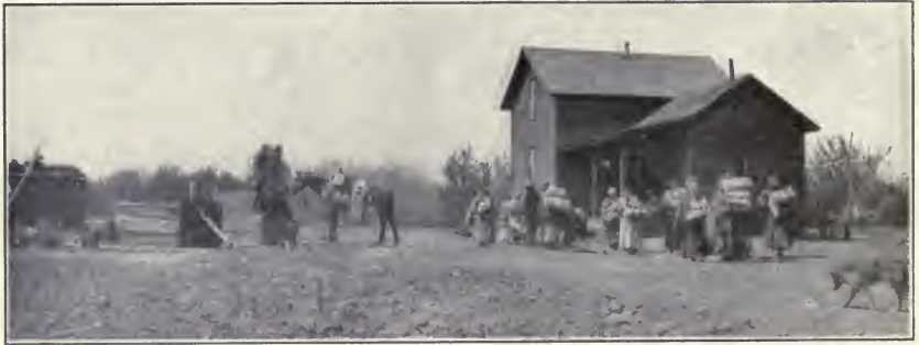
YAKIMA TRIBAL WEDDING SCENE, 1911. Bridal Party Arriving with Gifts.