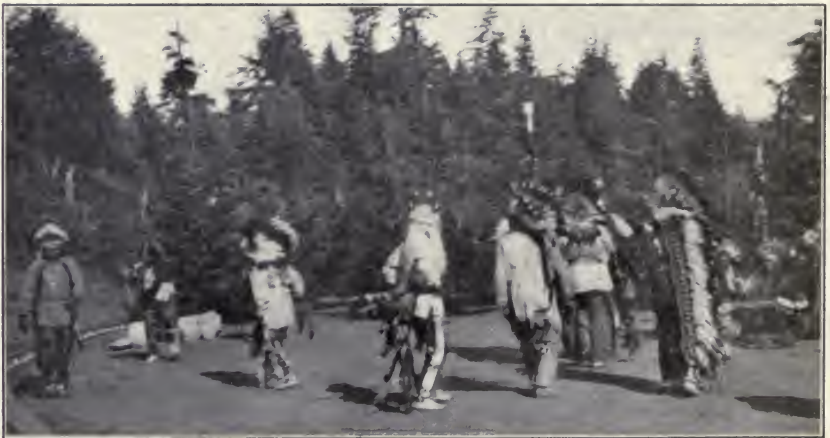
WAR DANCE OF THE YAKIMA, 1911.

Distrust rent their own ranks. Among the various leaders of the fourteen Confederated Tribes which comprise the Yakima, is the ever haunting fear of treachery. They were, however, practically united on one score. They would not exchange their allotments for the water which was theirs by the treaty of 1855. The Jones Bill was brigandage of the purest type. In the early stages of the trouble, mutterings and acrid denunciations of the "powers that be" were heard by one in close sympathy with a certain prominent chieftain. There loomed above the eastern slopes of the mighty Cascades, a cloud as dark and ominous as the shadow of death. A