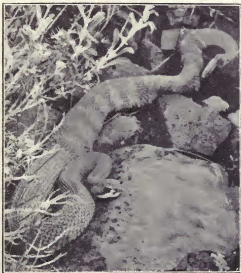
"Lurks in Ambush Along the Trail."

In November, 1911, there suddenly appeared on the Yakima Indian Reservation the Hon. Harve H. Phipps, attorney of Spokane, Washington, who ostensibly promulgated the banding of all the nation's wards into one great faction, "The Brotherhood of North American Indians." He unfolded a plan by which "good, honest" attorneys, regularly employed on percentage, would protect, in the halls of Congress and the courts of justice, not only the jeopardized water rights of the Yakimas, but all treaty guarantees