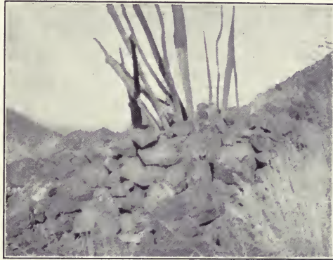
YAH'-YA-TOSH. Ancient Grave. Yakima Indian Reservation, 1912.