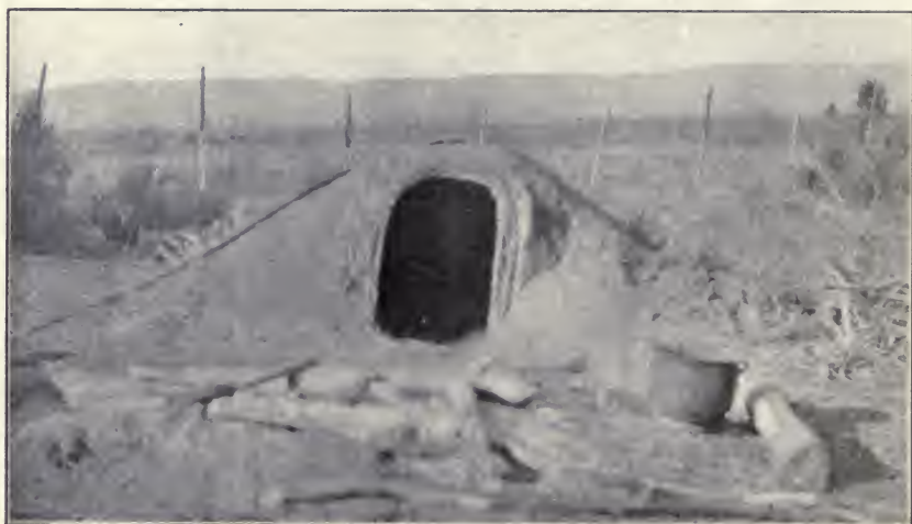
WHE-ACH (Sweat House). Yakima Indian Reservation, 1911.

This represents about fifty per cent of the land affected, while