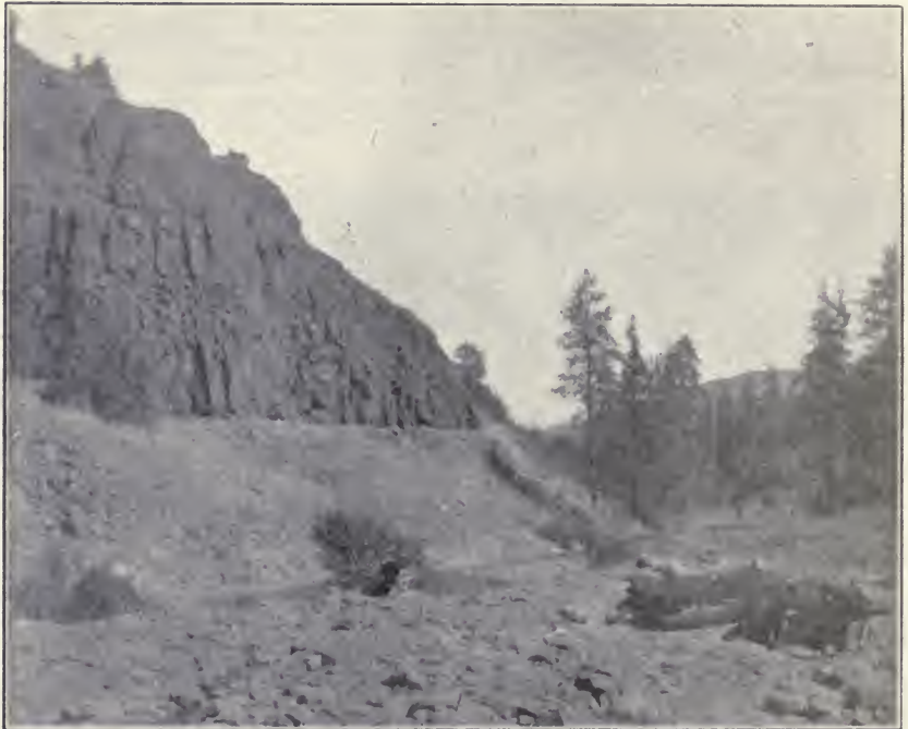
SCENE ON THE SATUS RIVER, 1906. River flows through Canyon in the foreground.