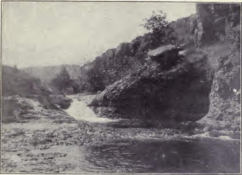
TOM-MAN-CHA-TAH-NEE'. KOHPT. (Falls of the Fish Trap.) Satus River Canyon, 1906. (Remy.)

their several petitions for redress of grievances elicited only vague promises, or were wholly ignored. The agency inspections were farcical; conducted secretly from the Indians, who were not permitted the opportunity to recite their wrongs. This blind business excited them. The Yakima were only dogs. Wild rumors were current that the reservation was to be thrown open, their lands sold or taken from them, and the streams confiscated by the Reclamation Service. Cattle thieves operated with impunity, and bootleggers plied their nefarious trade. (See Note 9.)