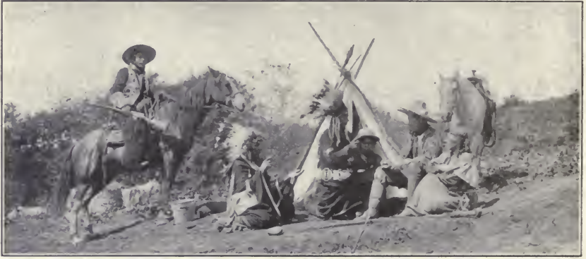
THE INTERVIEW. 1911.

In March, 1911, the following letter was sent to two hundred and nine Indians. From a number of these letters in my possession, I