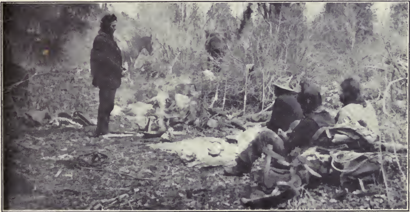
YAKIMA INDIAN HUNTERS IN CAMP, 1912. Story Telling while the Venison Broils.

The work of securing signatures was continued under somewhat modified tactics; "strays" were occasionally caught, and the list