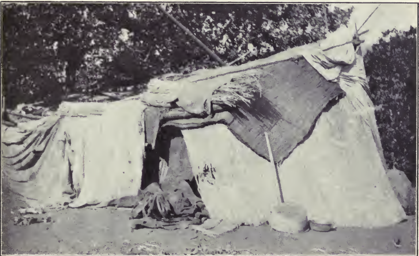
A SUMMER HOUSE OF THE YAKIMAS. Satus River Canyon, Yakima Indian Reservation, 1906.

"As you know, the Yakima Reservation presents an ideal situation for getting water on the land quickly and cheaply. Not a flume or syphon and scarcely a cut or fill on the entire project. Most of the land is reasonably near railroad, and would immediately be used for making homes. * * *