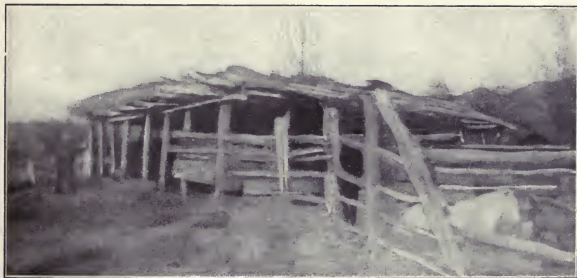
TYPICAL YAKIMA INDIAN BARN, 1912.

Notwithstanding the Yakimas have timber valued at more than three million dollars, they are unable to make any use of it in building improvements. The sawmill erected by the government in accordance with treaty stipulations, was burned more than twenty years