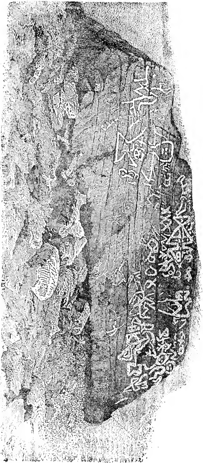
DIGHTON ROCK INSCRIPTION.