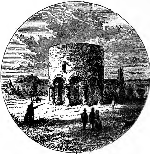
OLD STONE MILL

If this tower was standing when Rhode Island was first settled, it would have been a work of so great wonder as to have attracted general attention. Newport was founded in 1639, and