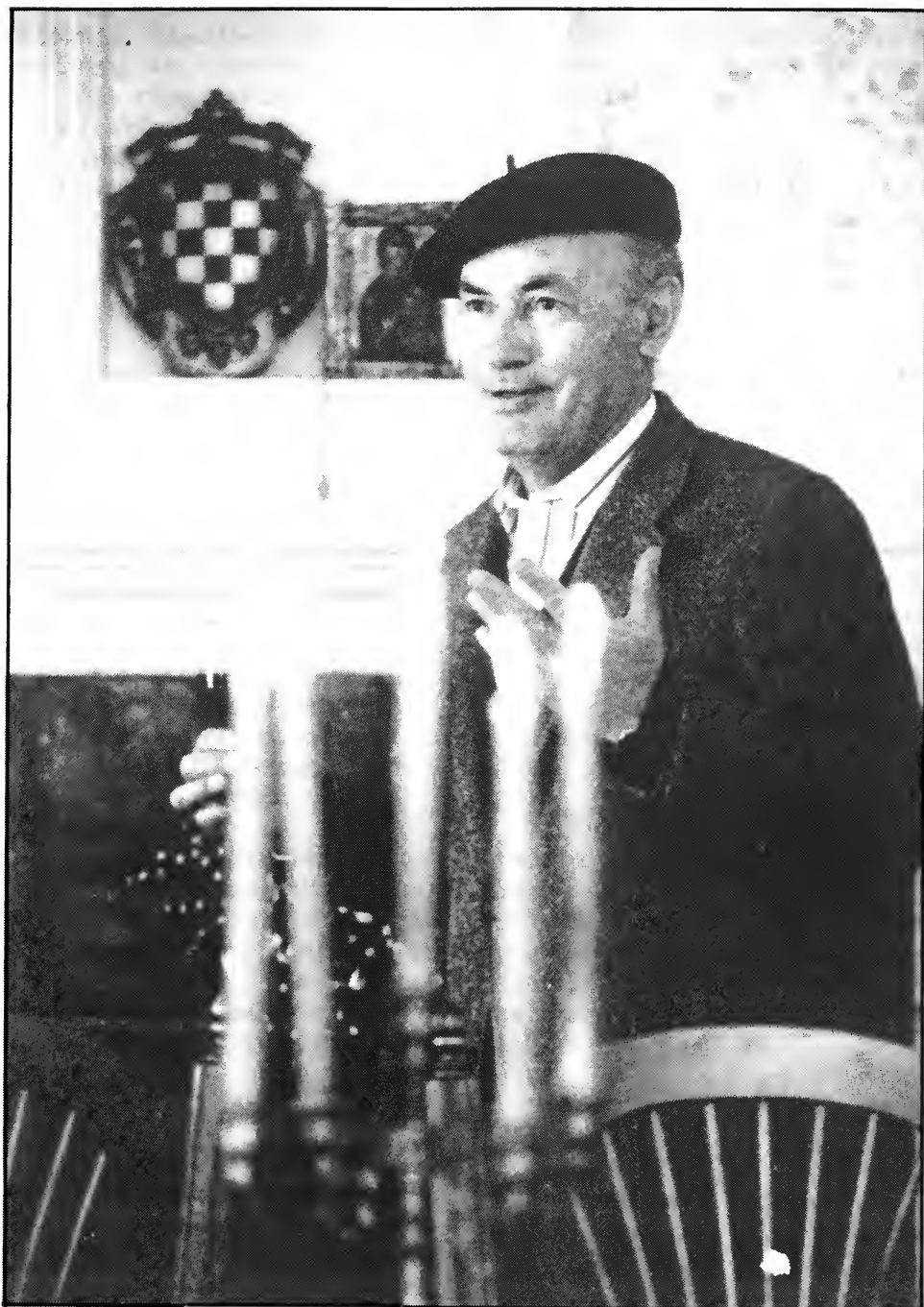
Miljenko Grgich, 1992