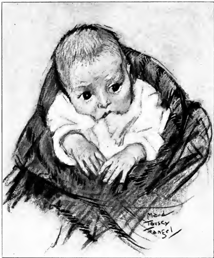
Somewhere in France