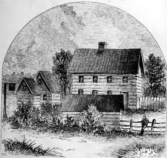
THE CROWN INN, 1757.