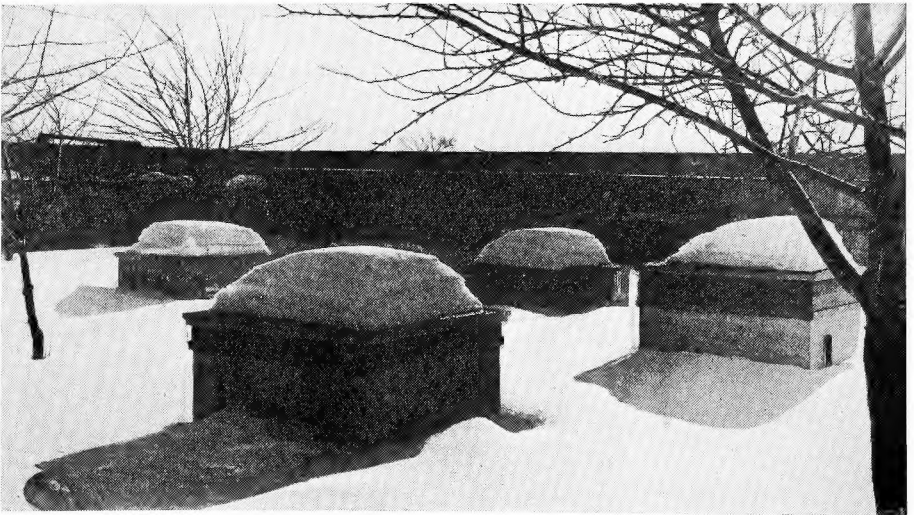
Wintering Bees at the Central Experimental Farm, Ottawa, in 4-Colony Cases.