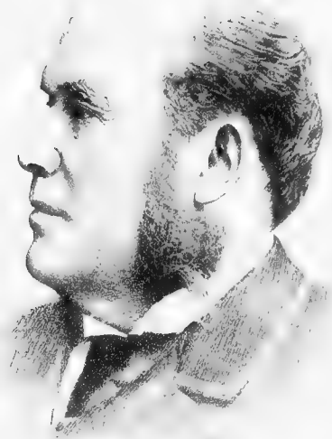
Philip D. Armour

The late Philip D. Armour, founder of the house of Armour & Co.