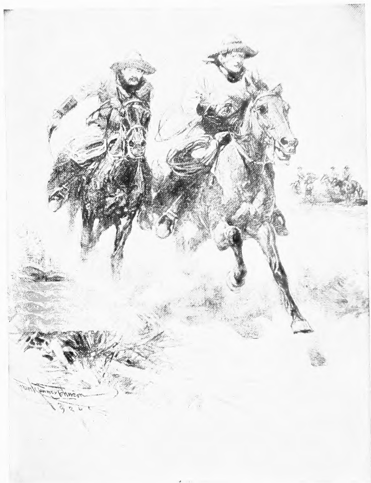
Sketch by Frank Tenney Johnson

"I guess we must a' bin three feet ahead, with a hundred yards to go. Split was a-cussin' an' spurrin', an' whippin'. I jes' whispered, 'Now, Stud! Now! Now!'"