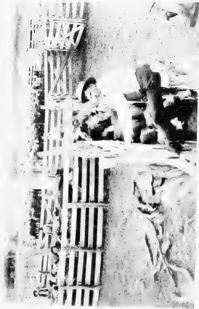
Separating Coys and Calves at Shipping Time, S. M. S. Ranch