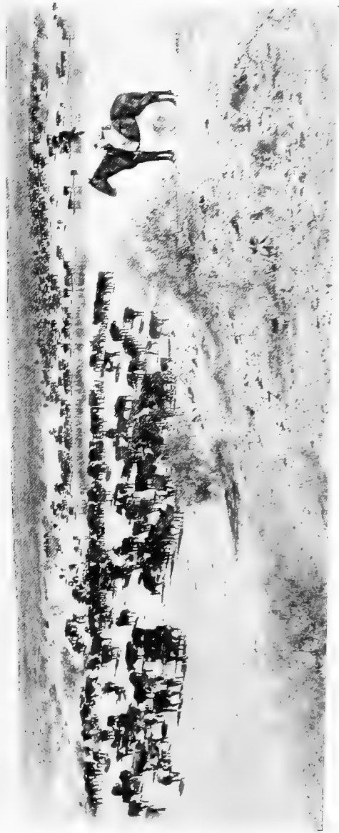
Throwing a Roundup on Water, S. M. S. Ranch