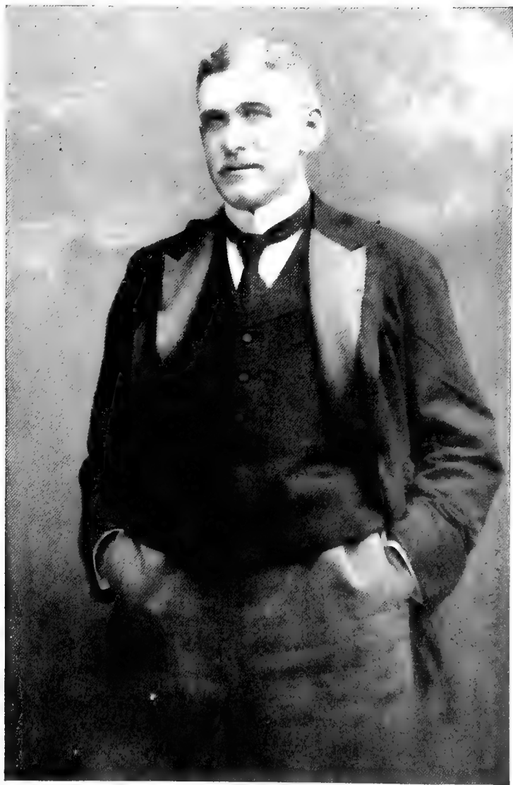
The late Kirkland B. Armour, head of the house of Armour & Co., Kansas City