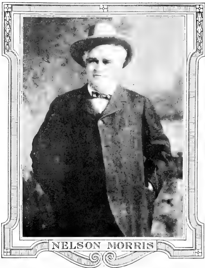
The late Nelson Morris, founder of the house of Morris & Co.