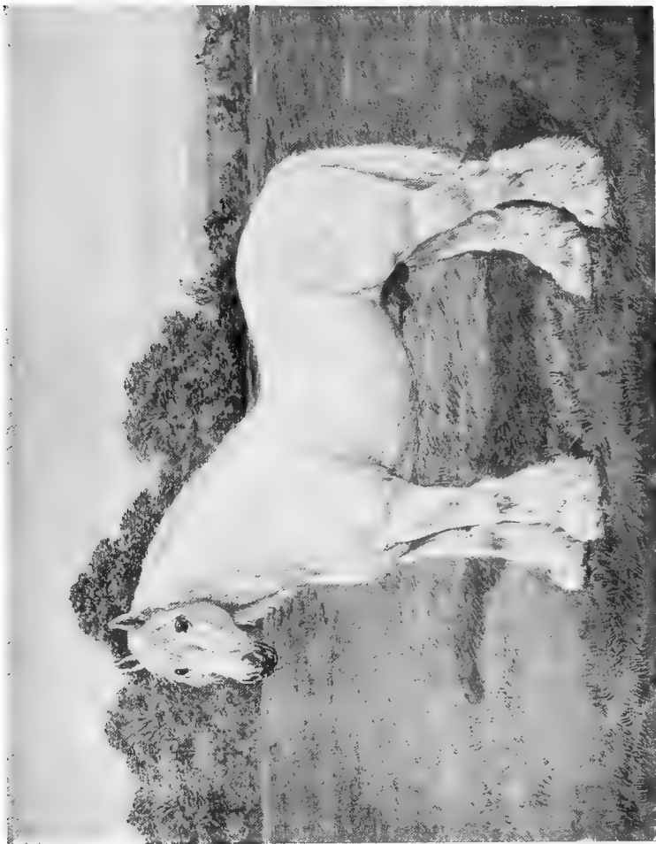
LINCOLNSHIRE LAD II.