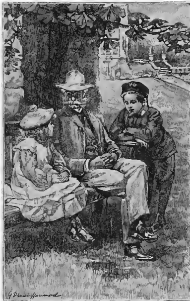
[Reduced Specimen of the Illustrations.] From "Pleasures and Pranks"