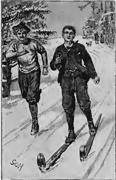
Reduced Illustration from "To Greenland".

"Just the book to put into a boy's hands. Every chapter contains boardings, cuttings out, fighting pirates, escapes of thrilling audacity, and captures by corsairs, sufficient to turn the quietest boy's head. The story culminates in a vigorous account of the battle of Trafalgar. Happy boys!"— The Academy .