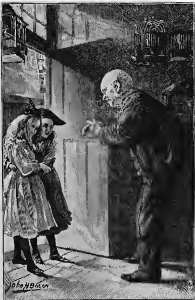
From " Things will Take a Turn " (Reduced.)

"We wish the winds would tell us stories like these. It would be worth while to climb Primrose Hill, or even to the giddy heights of Hampstead Heath in a bitter east wind, if we could only be sure of hearing such a sweet, sad, tender, and stirring story as that of Hilda Brave Heart, or even one that was half so good."— Academy .