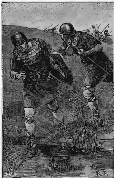
Reduced Illustration from "Wulf the Saxon".

In crown 8vo, cloth elegant, olivine edges.