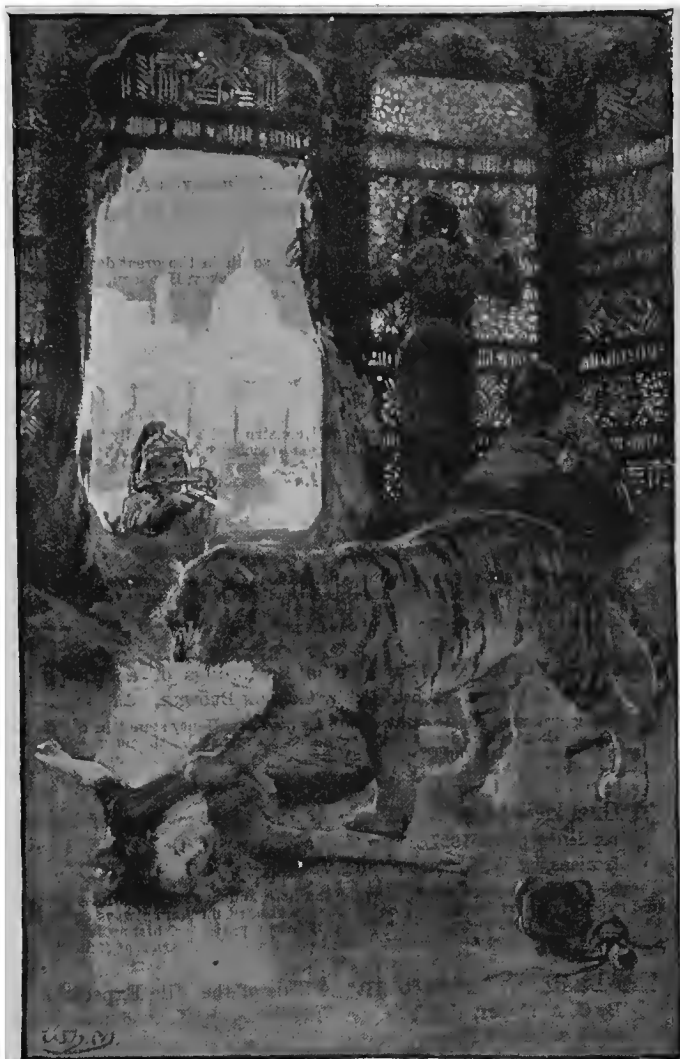
"DICK TOOK STEADY AIM, AND FIRED AT THE TIGER."