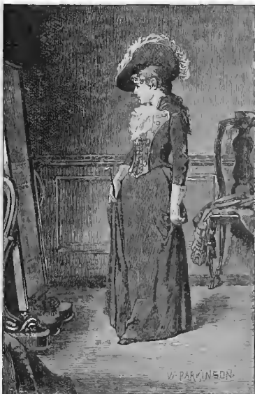
Reduced Illustration from "Cousin Geoffrey"