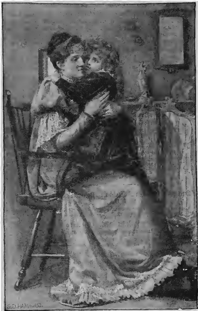
"OLIVE LEAPT INTO HER MOTHER'S ARMS."