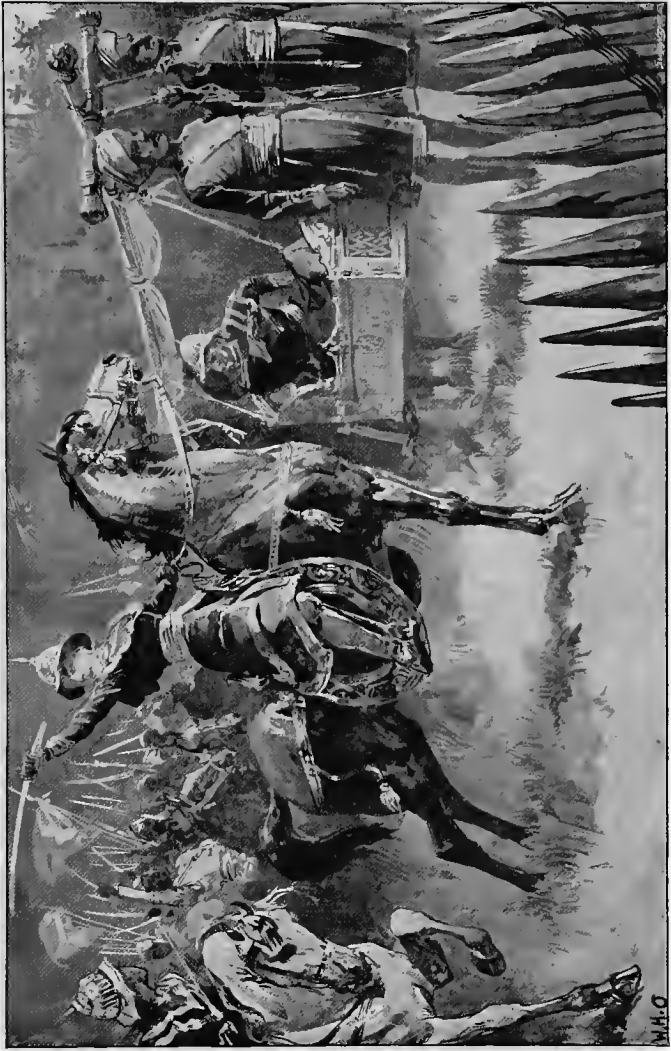
"THE OLD BURMESE GENERAL WAS CARRIED FROM POINT TO POINT IN A LITTER."