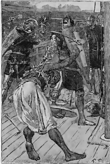
Reduced Illustration from "A Knight of the White Cross"

In crown 8vo, cloth elegant, olivine edges.