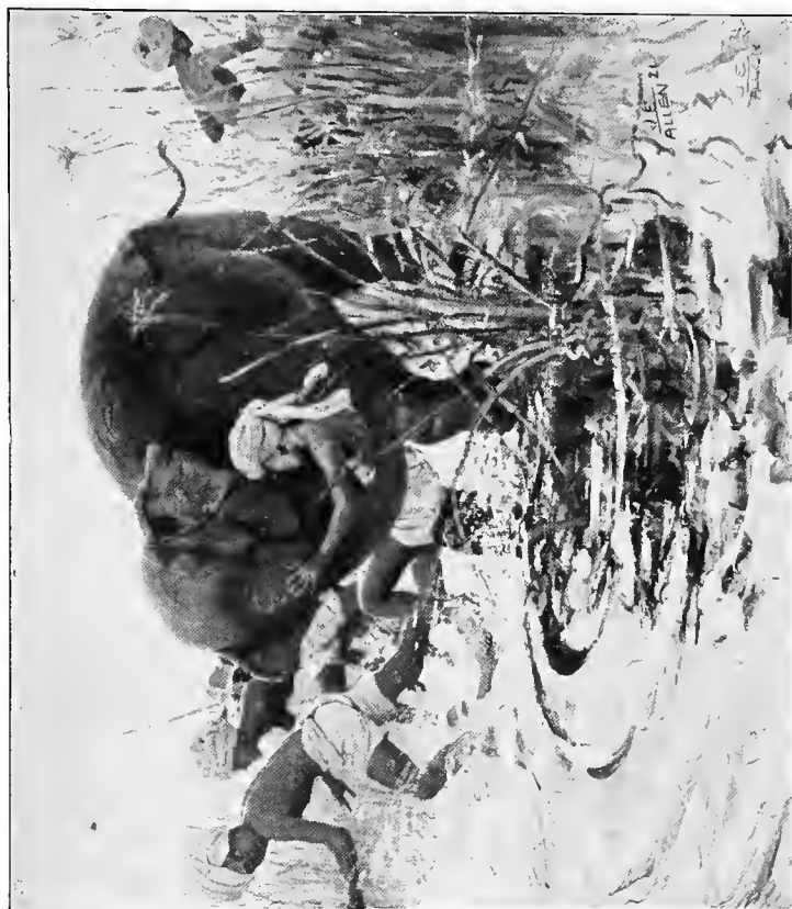
KARI PUNISHES SUDU