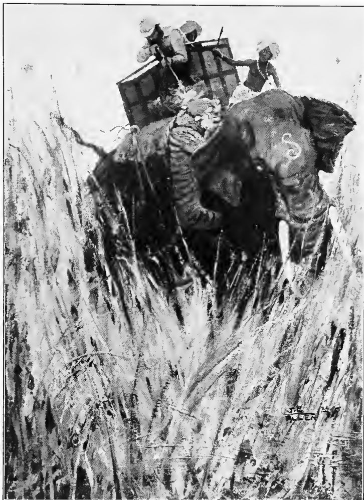
WITHOUT ANY WARNING THE MAGISTRATE FIRED