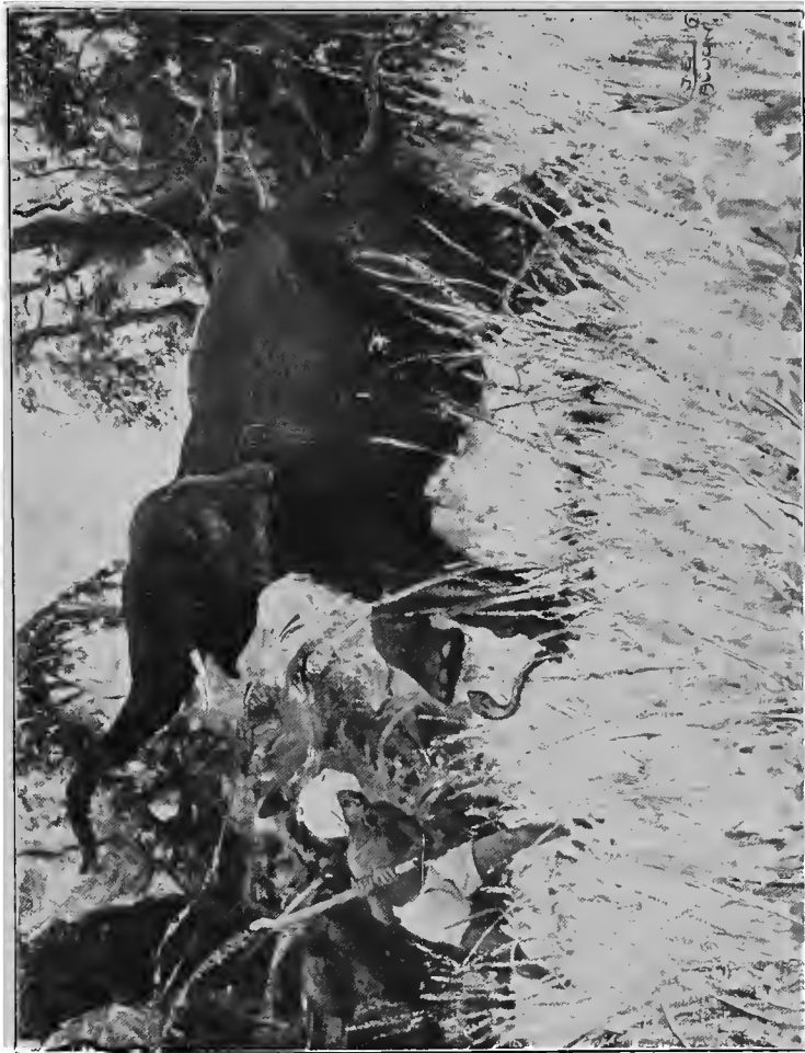
THAT VERY INSTANT THE UP-RAISED FOOT OF THE ELEPHANT WAS ON HIS HEAD