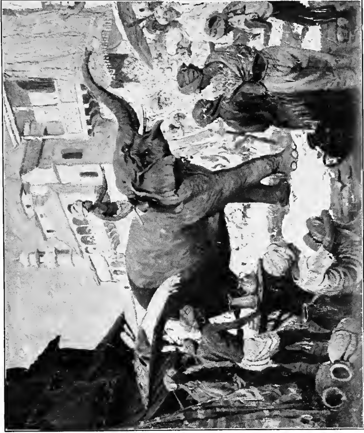
ONE DAY I TOOK THEM TO THE BAZAAR