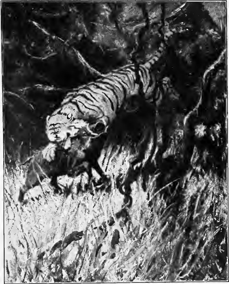
THE TIGER HAD FOUND HIS KILL