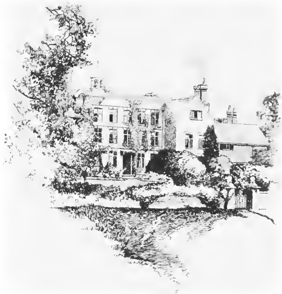
The House of 'Quint'