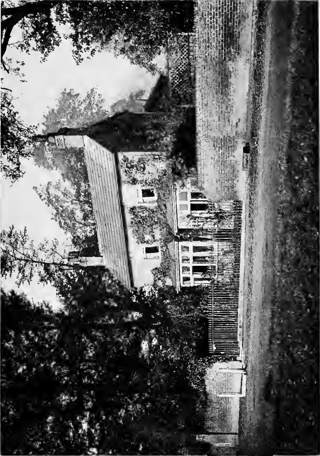
Collage at Hallsford