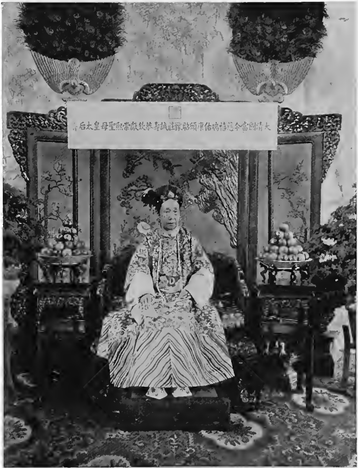
Her Imperial Majesty, Tsze She-Duan Yo-Kong Yee-Joan Yu-Ghwong Chung-Sho Goong-Chin Shen-Tsung She, Empress Dowager of China, in her full yellow dragon robe with sable hat