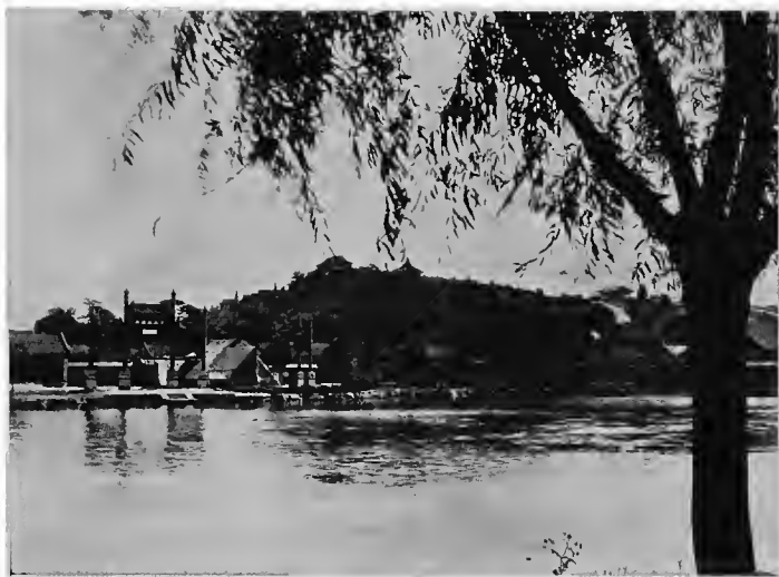
North View of the Summer Palace