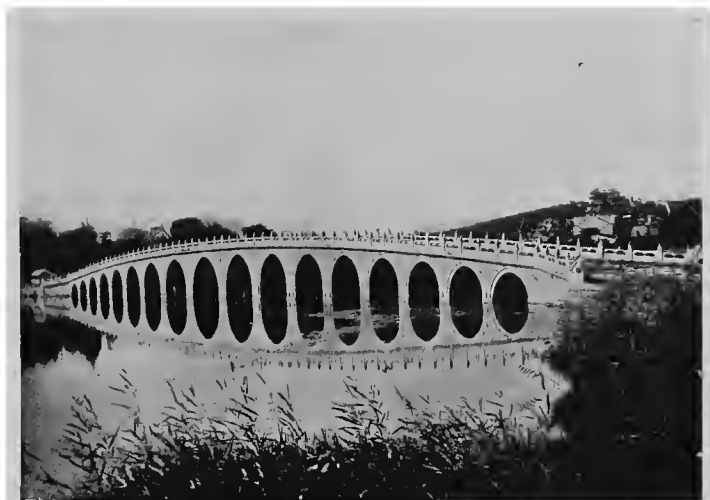
Bridge at the Summer Palace