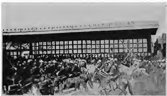
Stand erected for Foreigners by the Wei Wu Puh, in the Manchu City, and end of funeral followed by Palace Guards.