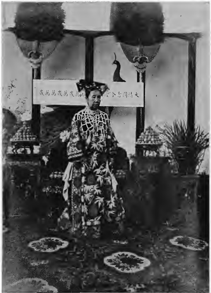
The Empress Dowager dressed in her bamboo leaf embroidered robe and wearing her famous pearl cape made of three thousand five hundred pearls of perfect shape and color