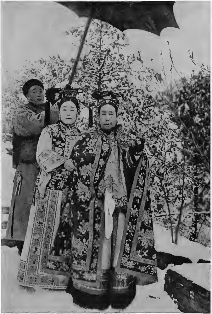
The writer assisting Her Imperial Majesty, the Empress Dowager of China, going down Peony Hill toward her Palace