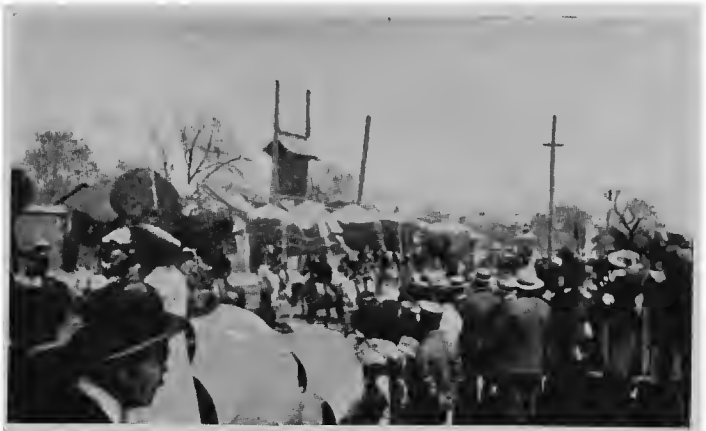
Umbrella Carriers in the Funeral