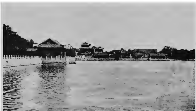
East Side of the Lake inside of the Summer Palace