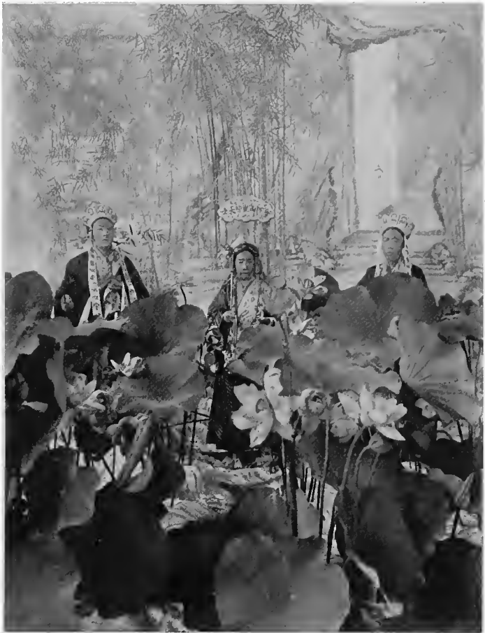
The Empress of China dressed as the Goddess of Mercy, with Li Lien Ying, first eunuch, and Tsue Yu Gay, second eunuch, as her attendants