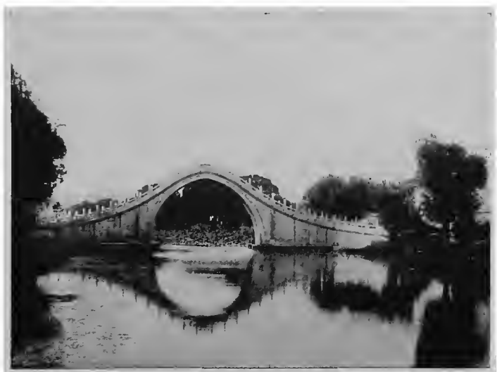
The Jade Girdle Bridge—Summer Palace