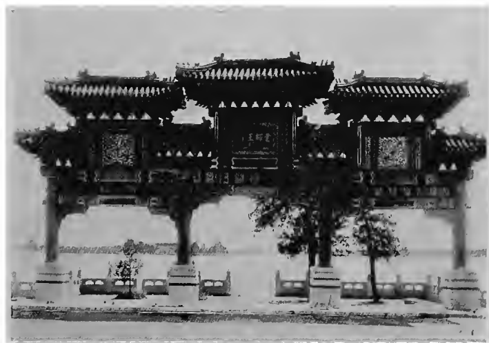
Pai Lou (Archway)—Summer Palace