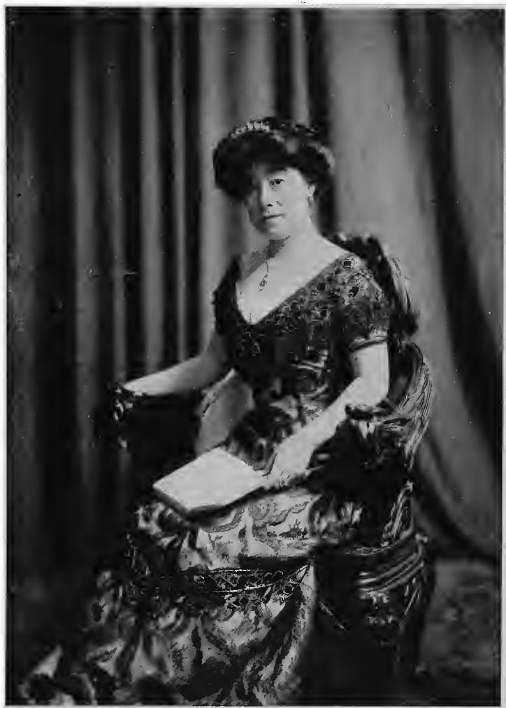
The Princess Der Ling in Evening Costume