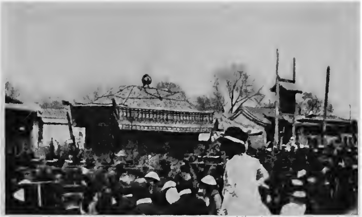
Emperor's Coffin carried by "600" Pole-bearers