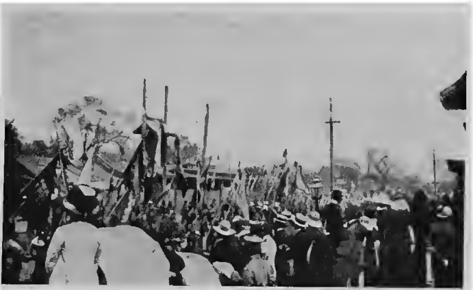
Flag Carriers in the Funeral