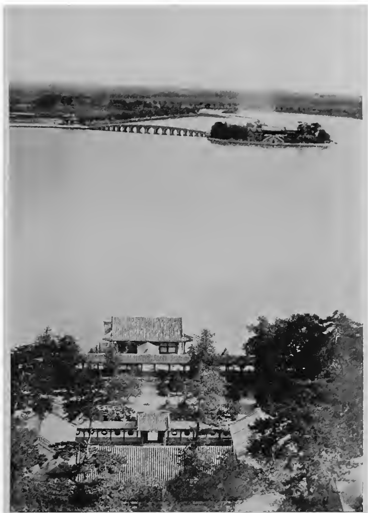
View taken from Pei Yeun Dien, Spreading Cloud Pavilion, Summer Palace