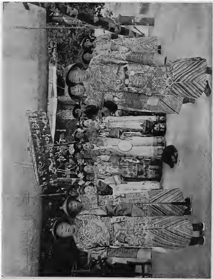
Her Imperial Majesty walking to the theatre after the morning audience. The Young Empress, wife of Kwang Hsu, is standing on Her Majesty's right.

Her famous dog is lying on the ground in front of her