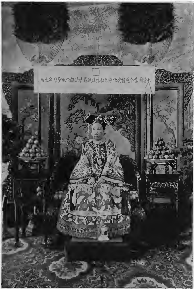
The Empress Dowager in her one hundred butterfly robe, beneath which can be seen one of her shoes trimmed with pearls and other precious stones