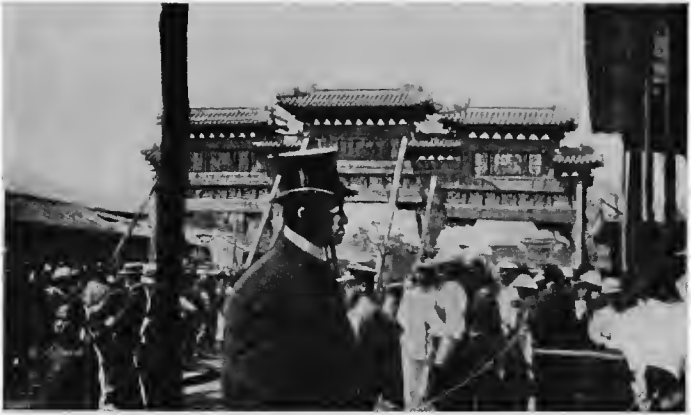
Foreigners in Front of Stand Waiting for the Funeral