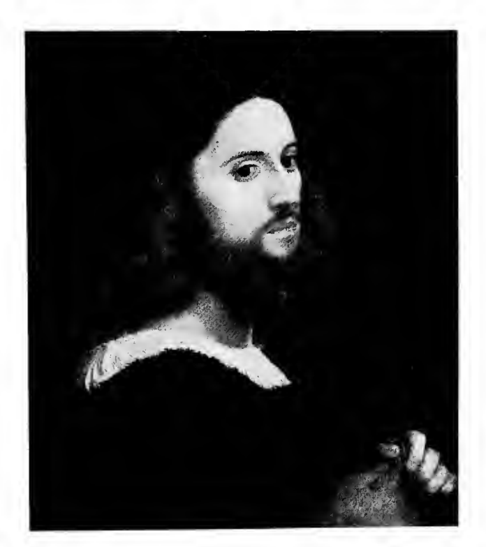
30 PORTRAIT OF A MAN By Giorgione