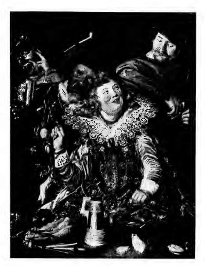
21 THE MERRY COMPANY By Frans Hals