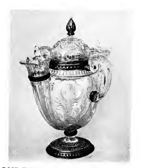
ROSE WATER VASE OF ROCK CRYSTAL Italian, sixteenth century