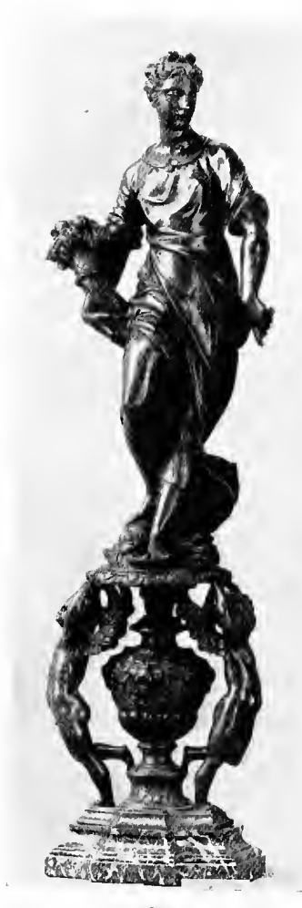
65 PEACE By Alessandro Vittoria