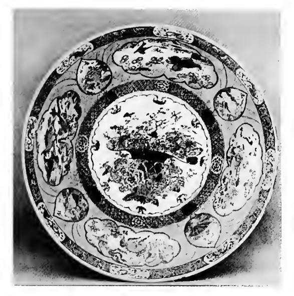
PLATE Famille Verte K'ANG HSI, 1662–1722