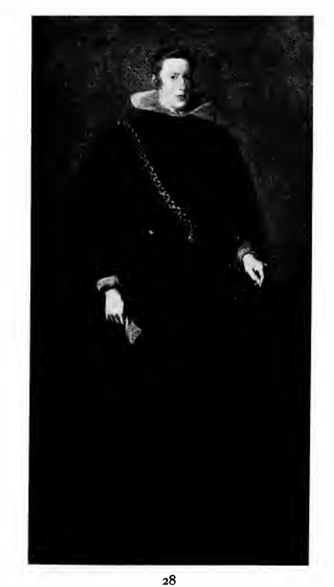
PHILIP IV OF SPAIN By Velazquez