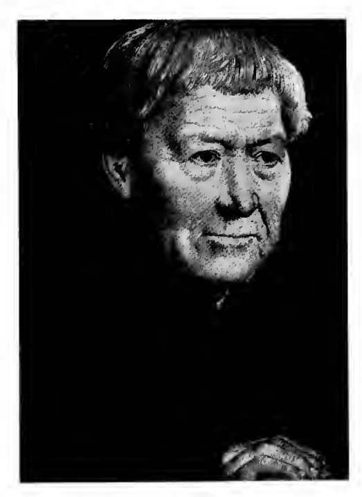
50 PORTRAIT OF AN OLD MAN By Hans Memling