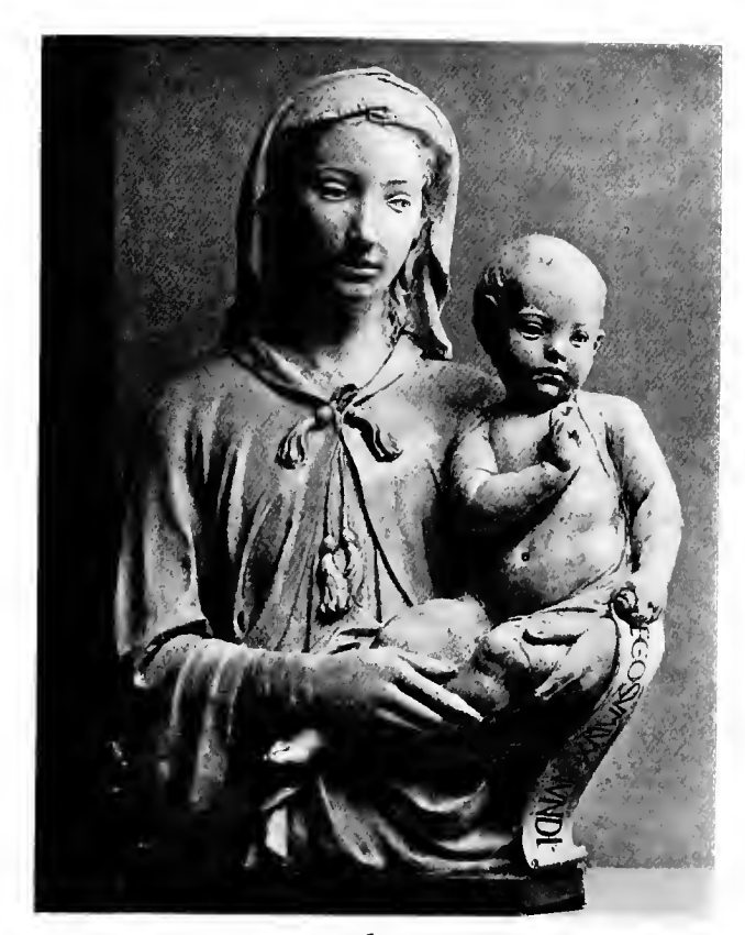
61 MADONNA AND CHILD By Luca della Ròbbia