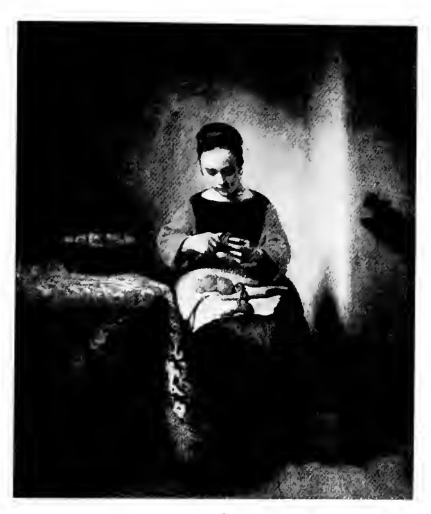
16 YOUNG GIRL PEELING AN APPLE By Nicolaes Maes