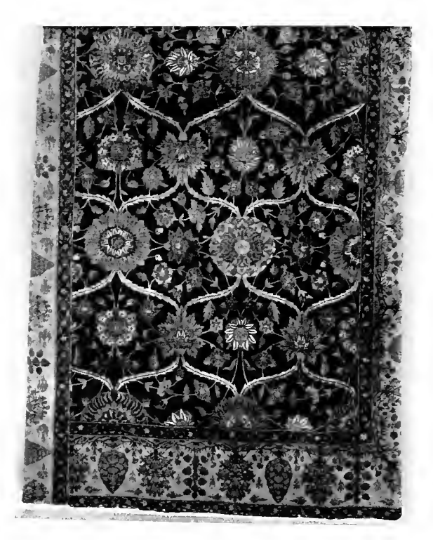
NO. 89 PART OF RUG, FLOWER AND TRELLIS DESIGN Indian, about 1580