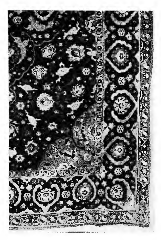
NO. 86 RUG Central Persian, about 1580