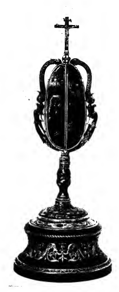
GOLD AND ENAMEL TRIPTYCH Milanese, late fifteenth century