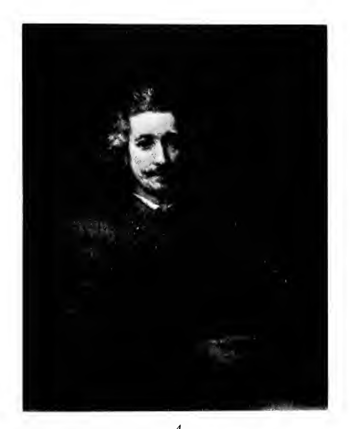
4 THE MAN WITH A MAGNIFYING-GLASS By Rembrandt