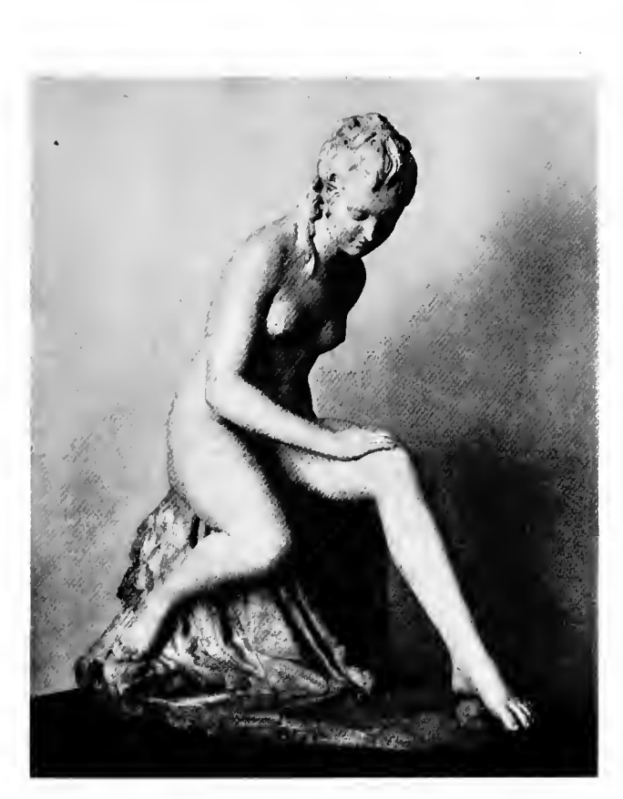
74 THE BATHER, MARBLE By Jean Antoine Houdon