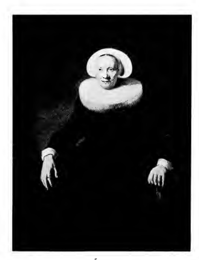
5 AN OLD WOMAN IN AN ARM-CHAIR By Rembrandt