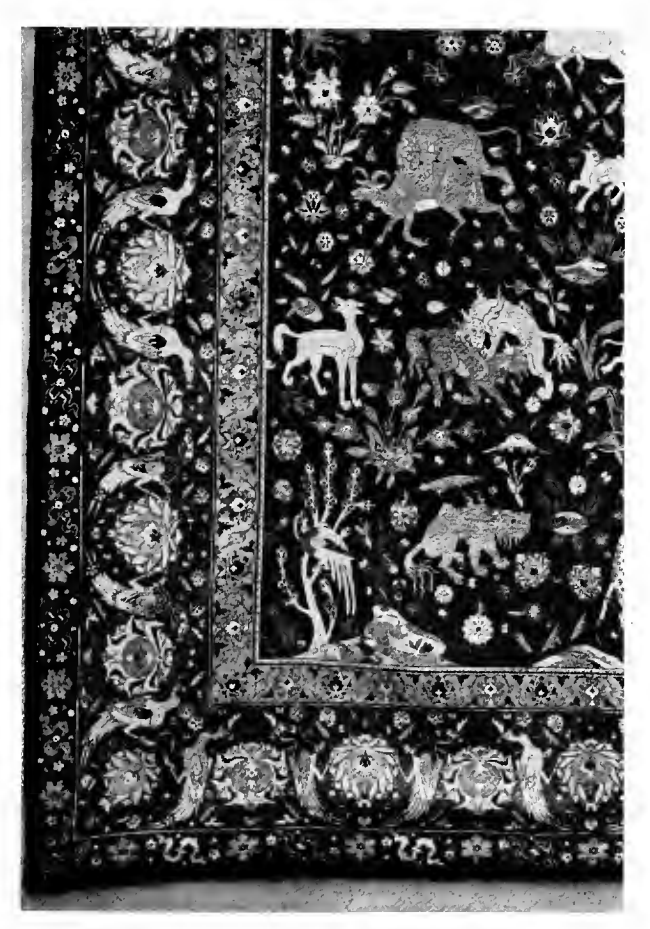
NO. 88 SILK ANIMAL RUG Central Persian, last balf of sixteenth century