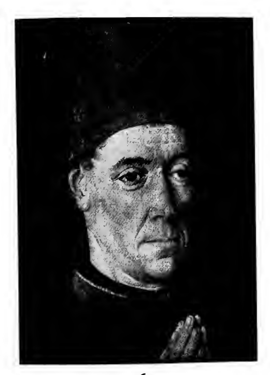
46 PORTRAIT OF A MAN By Dirk Bouts