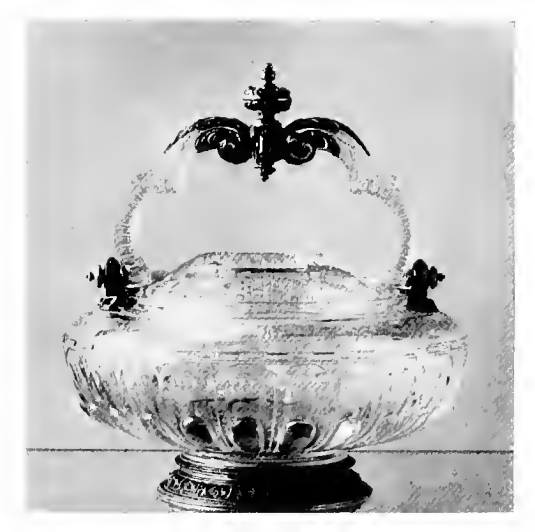
PORTABLE HOLY WATER STOUP Italian, sixteenth century