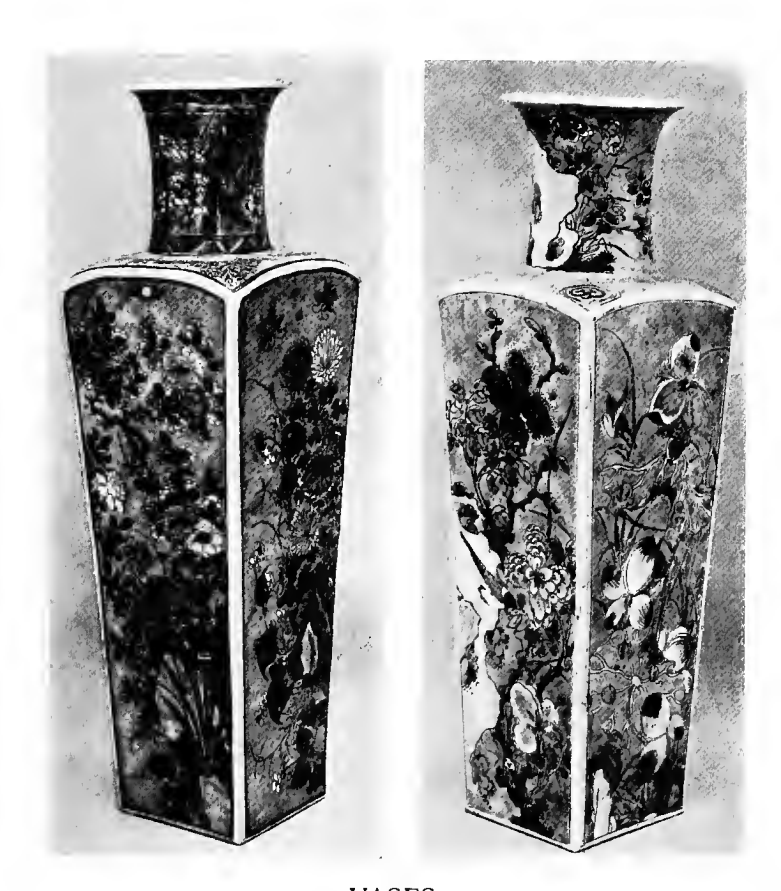
VASES Famille Jaune K'ANG HSI, 1662–1722