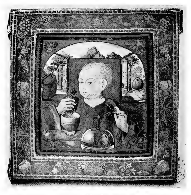
NO. 81 INFANT CHRIST, SYMBOLIZING HIS SACRIFICE Late Gothic, end of fifteenth century