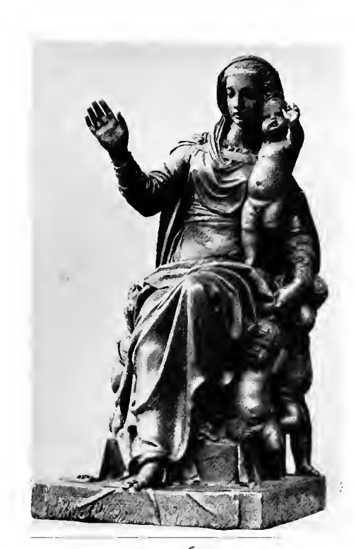
60 CHARITY By Jacopo Sansovino