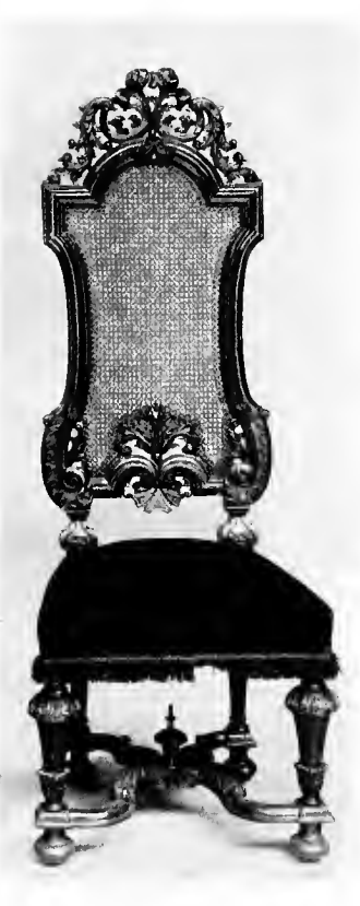
CHAIR, ENGLISH Late seventeenth century