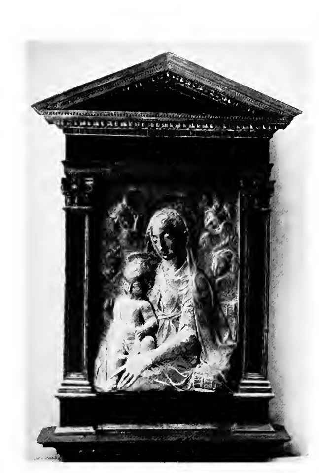
66 MADONNA AND CHILD, By Antonio Rossellino