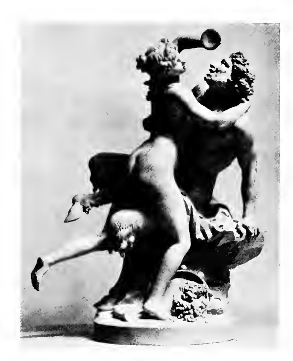
75 THE INTOXICATION OF WINE By Claude Michel, called Clodion