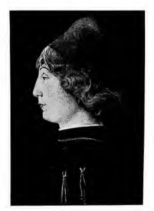
44 BORSO D' ESTE By Cosimo Tura