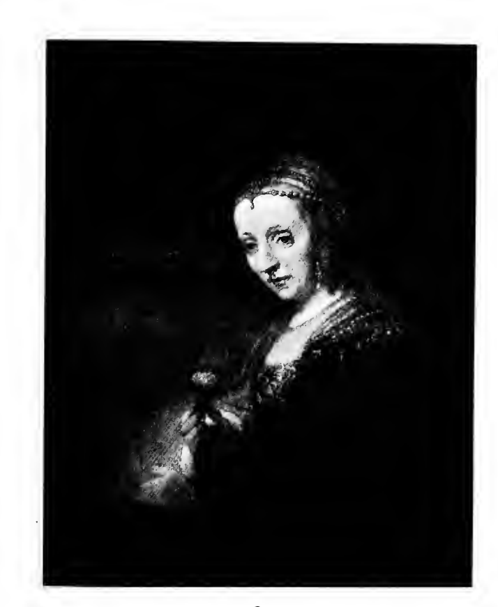
2 THE LADY WITH A PINK By Rembrandt