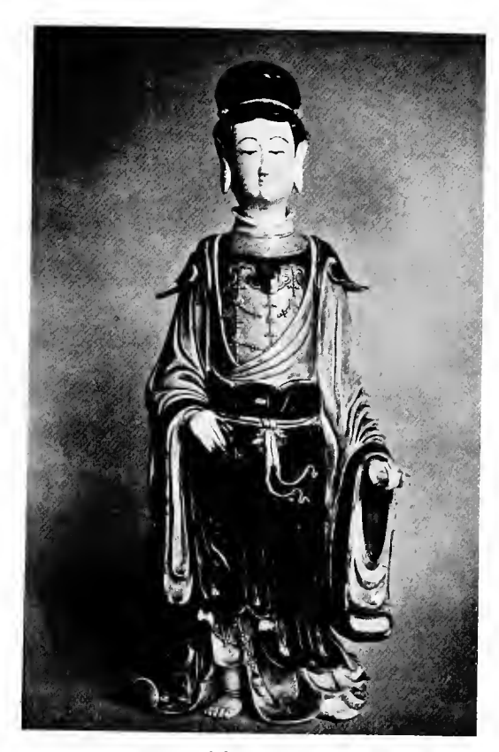
NO. 17 GODDESS KUAN YIN Ming Dynasty, 1368–1643