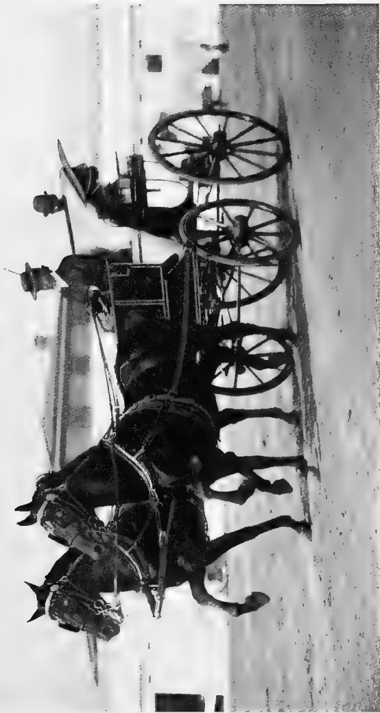
A CAPITAL PHAETON PAIR.