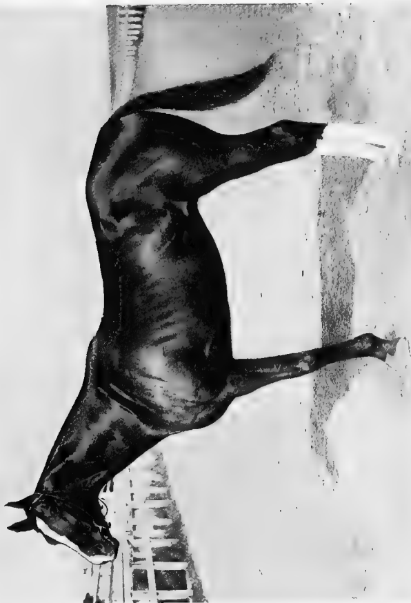
A STEEPLECHASE TYPE.