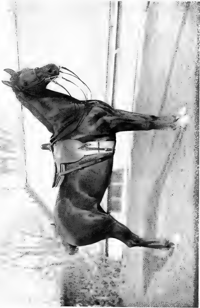
MY DAUGHTER'S SADDLE-HORSE.