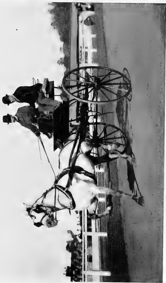
EVEN ALL-ROUND ACTION.