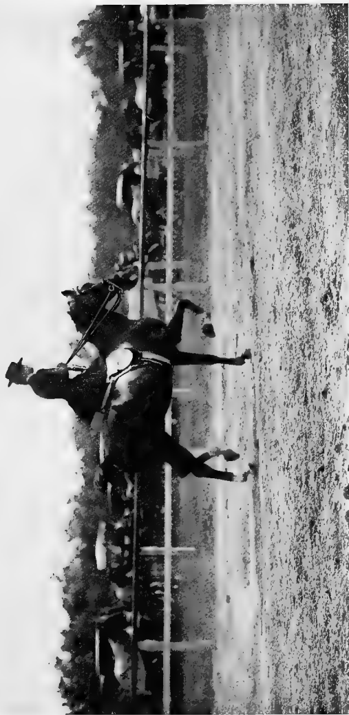
ON GOOD TERMS.