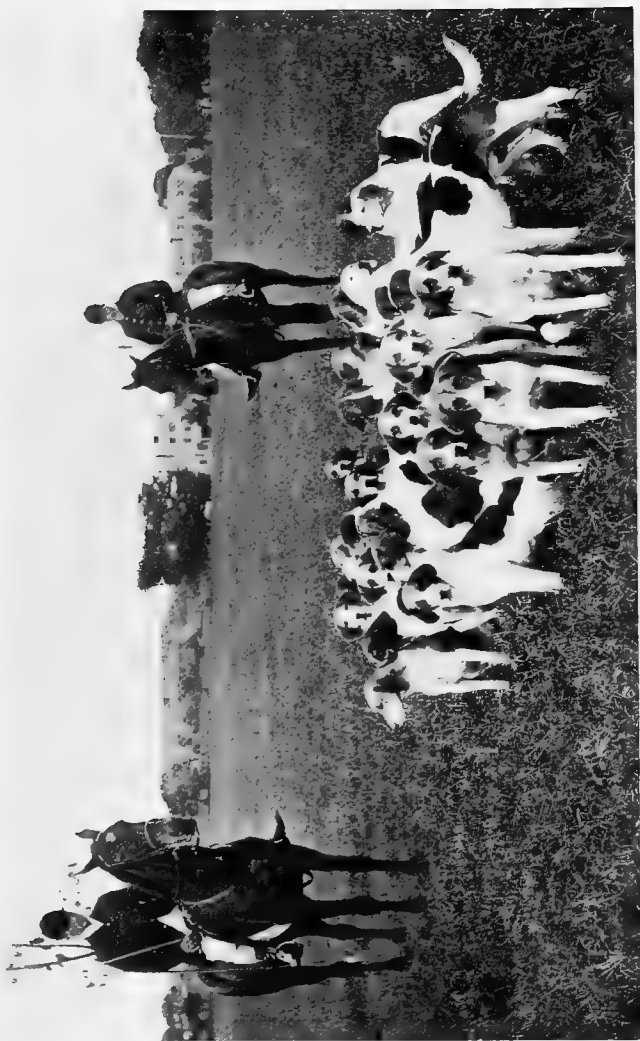
“PACK UP! ALL OF YER!”