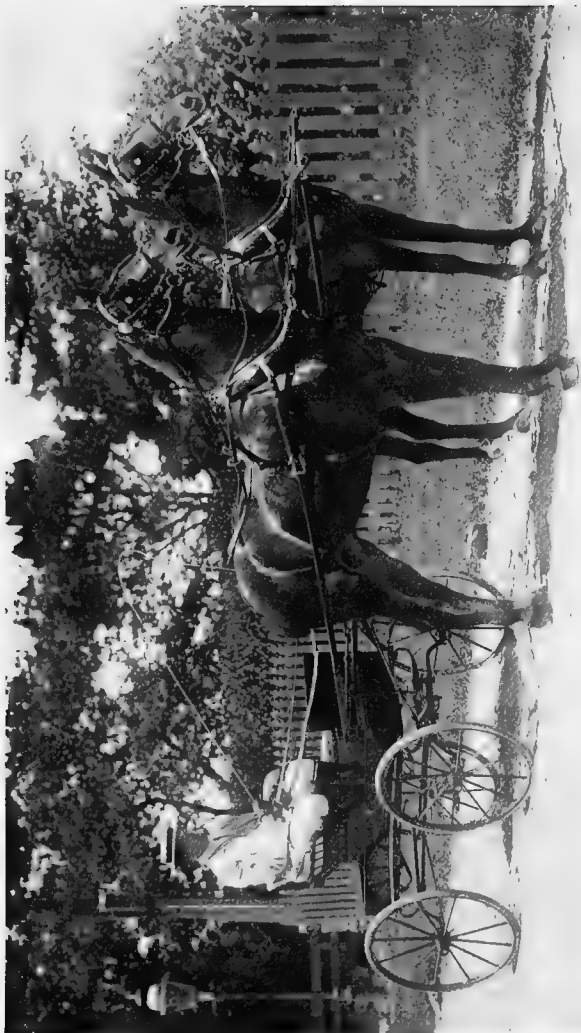
FOR ROAD WORK.