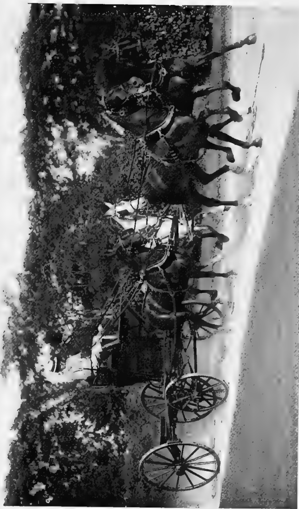
FOURTEEN MILES AN HOUR.