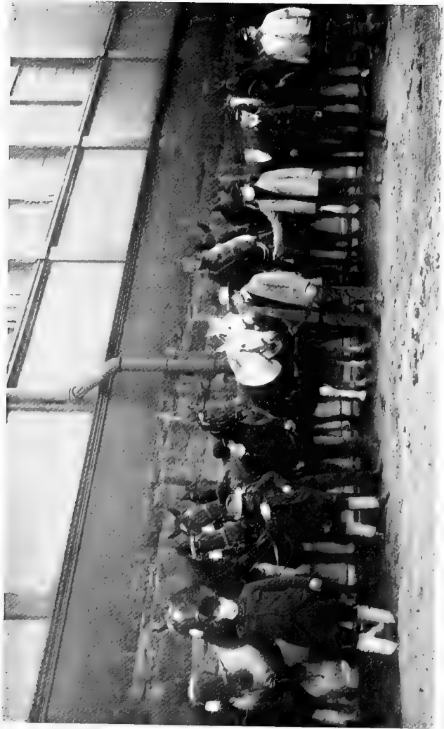
JUST FROM THE COUNTRY.