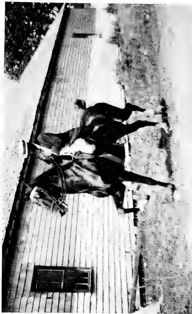
A WEIGHT CARRIER.