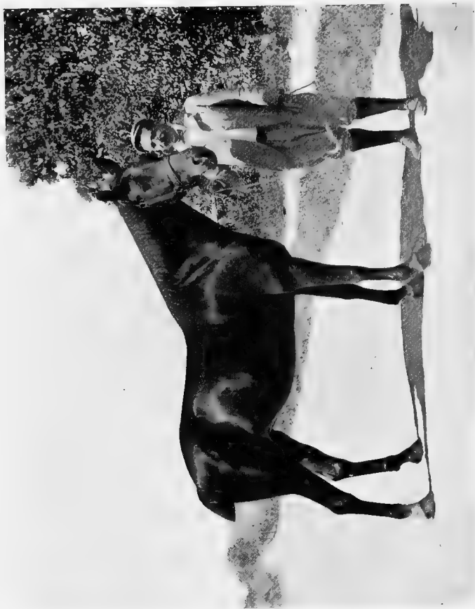
A SMOOTH PEBBLE.