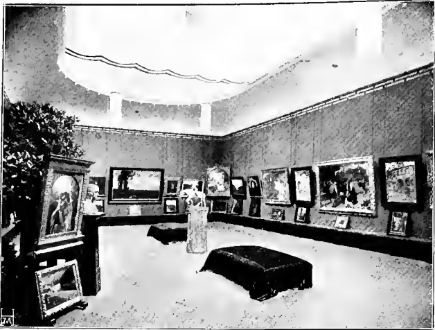
MAIN HALL WITH SKY-LIGHT FRONT-VIEW