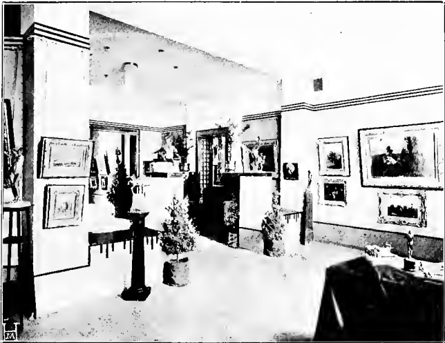
INTERIOR — PARK-SIDE