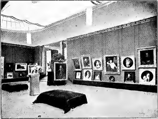
MAIN HALL WITH SKY-LIGHT SIDE-VIEW