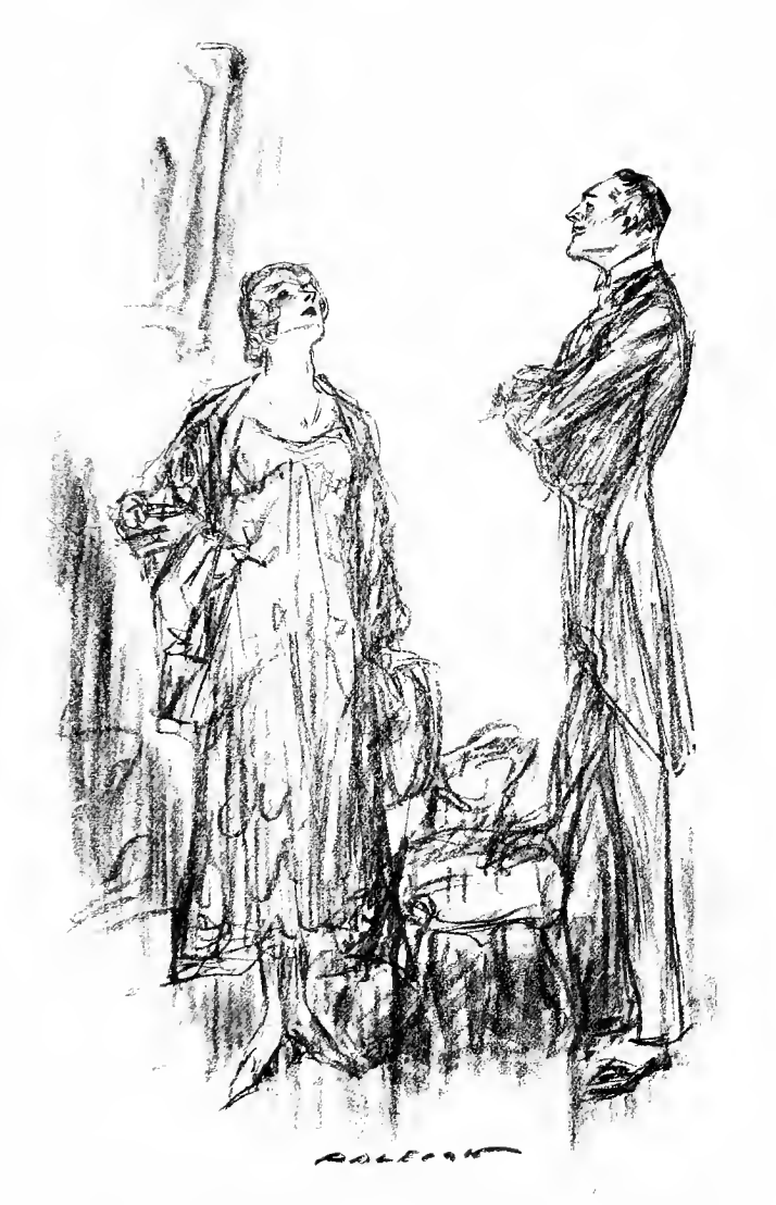
"You mean because she's a suffragist? You sent her away for that? Why, really, that's tyranny! "