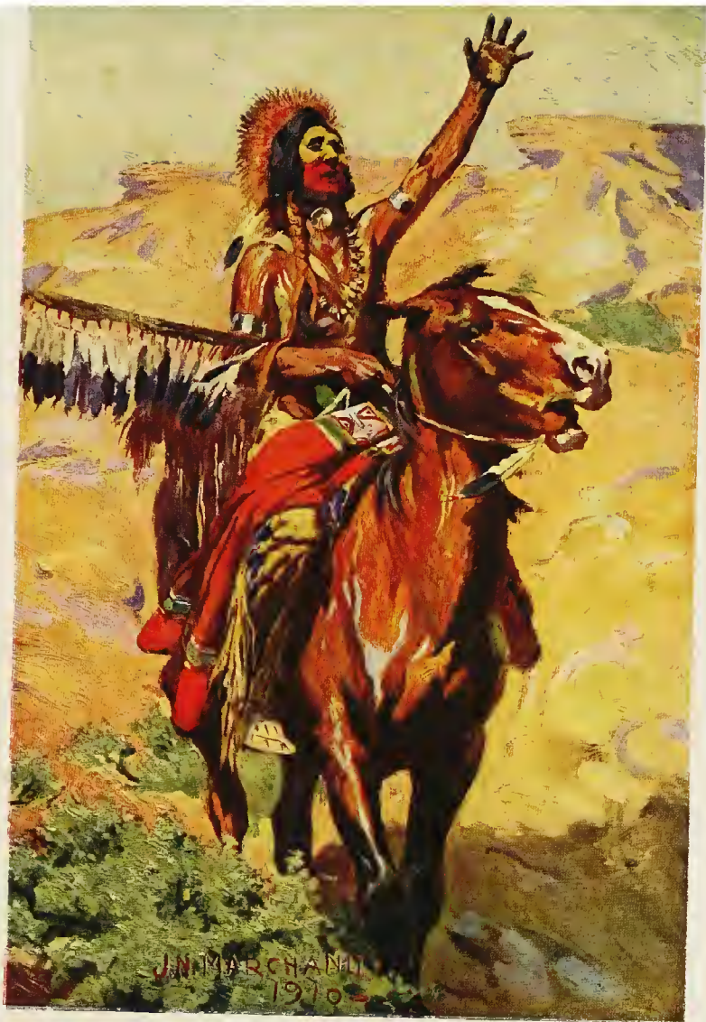
Every movement of ours had been watched by Indian scouts