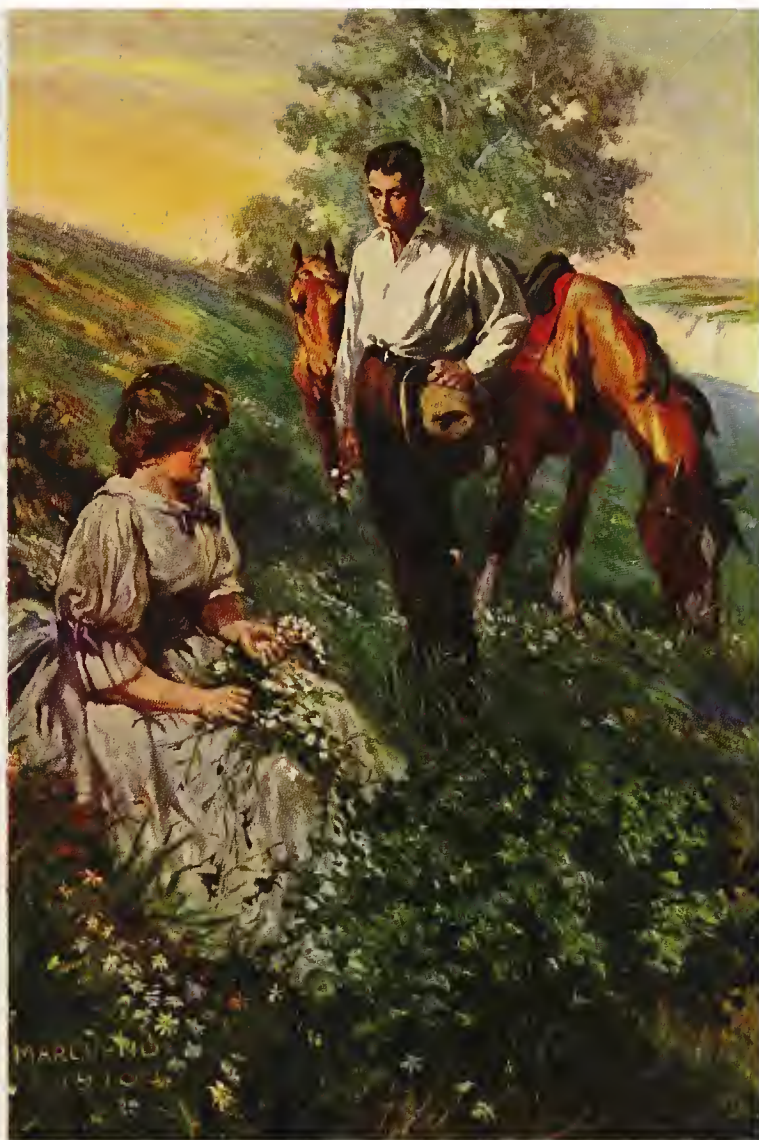
"Come, Phil," she cried, "come, crown me Queen of May here in April!"