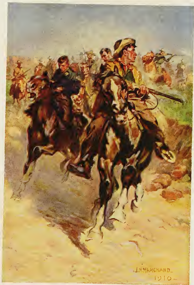
Like the passing of a hurricane, horses, mules, men, all dashed toward the place